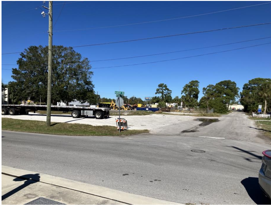
COURT STREET SCENE LOOKING NORTH FROM AVERY ROAD