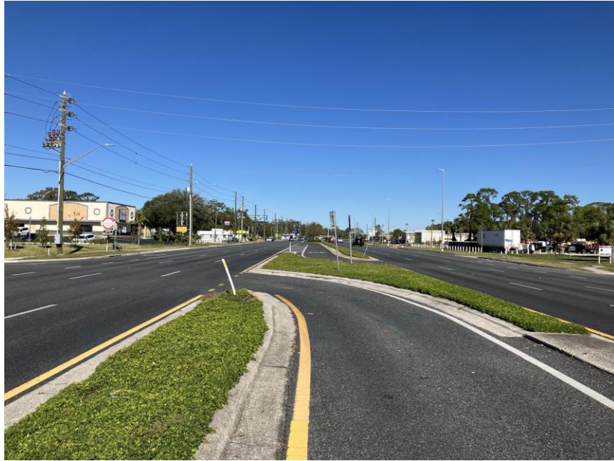
US HIGHWAY 19 STREET SCENE LOOKING FROM AVERY ROAD MEDIAN CUT TOWARDS SUBJECT FRONTAGE ON RIGHT