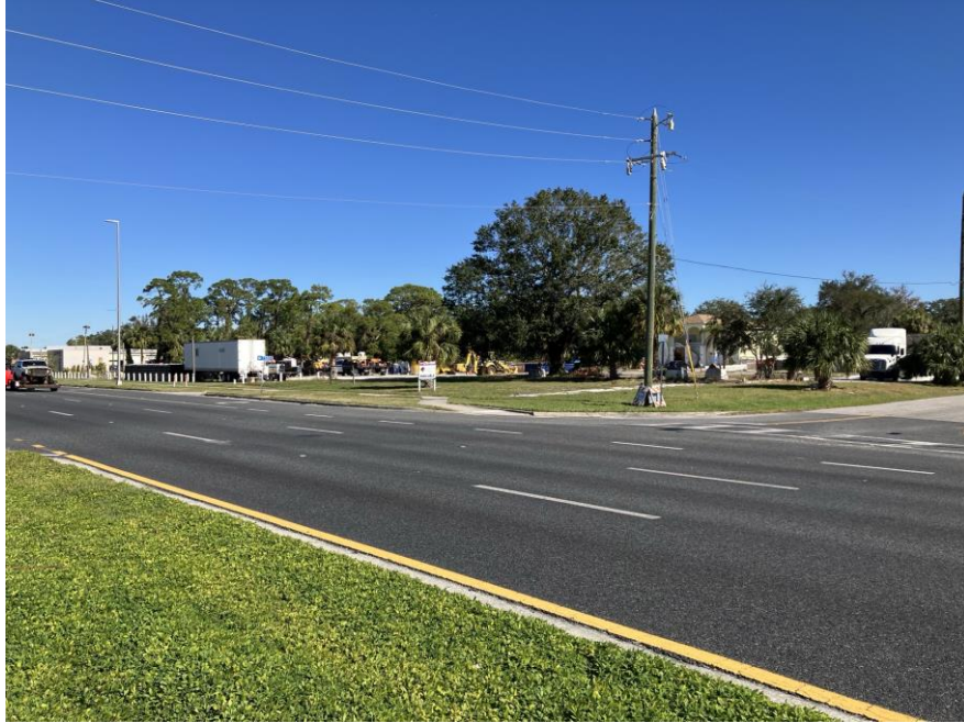
SITE VIEW LOOKING NORTHEAST FROM AVERY ROAD