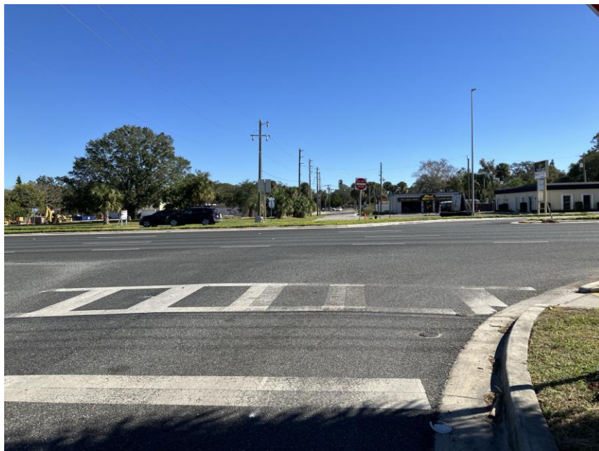
AVERY ROAD STREET SCENE LOOKING EAST FROM US HIGHWAY 19