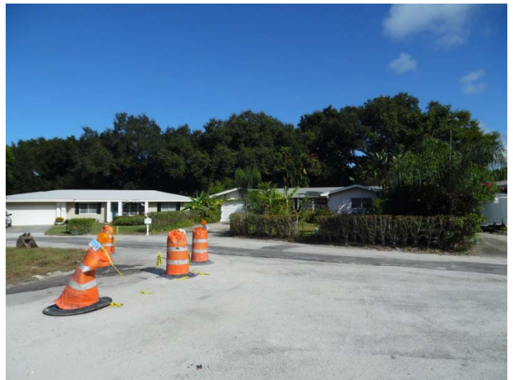
Across the street, to the north of the subject property