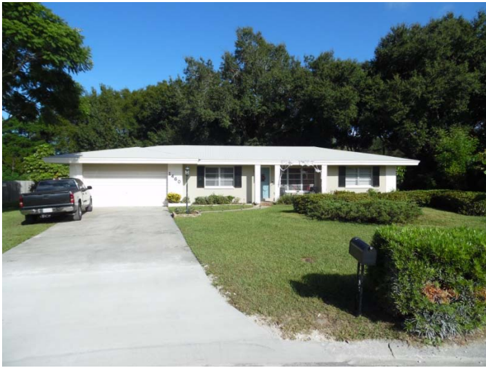
View looking north at the subject property, 1460 Grove Circle Court