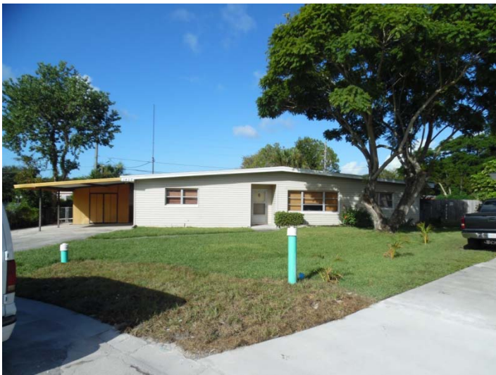
West of the subject property