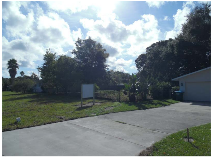
East of the subject property