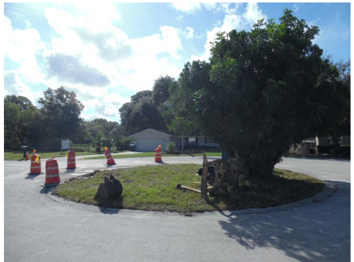
Across the street, to the south of the subject property