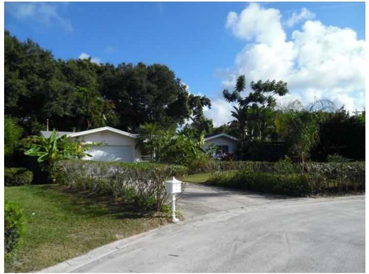
East of the subject property