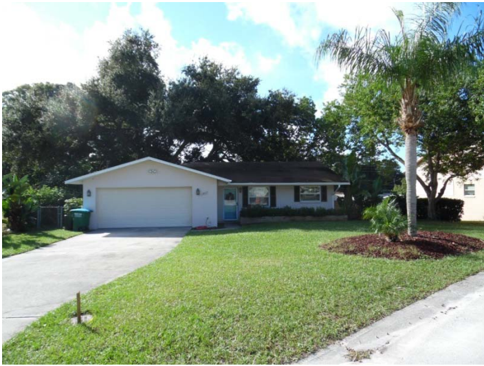
View looking south at the subject property, 1467 Grove Circle Court