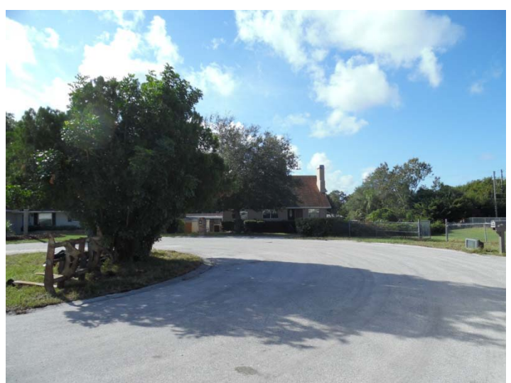
View looking westerly along Grove Circle Court

ANX2015-10027 Israel Ayala Vega 1460 Grove Circle Court