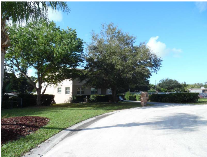
West of the subject property