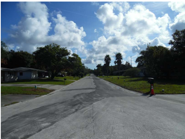
View looking easterly along Grove Circle Court