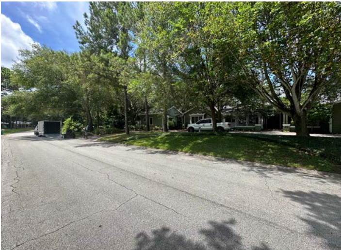
South of the subject property