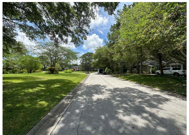
View looking southerly along McCauley Road

ANX2023-06006 Ronald and Mireille Pollack 1862 McCauley Road