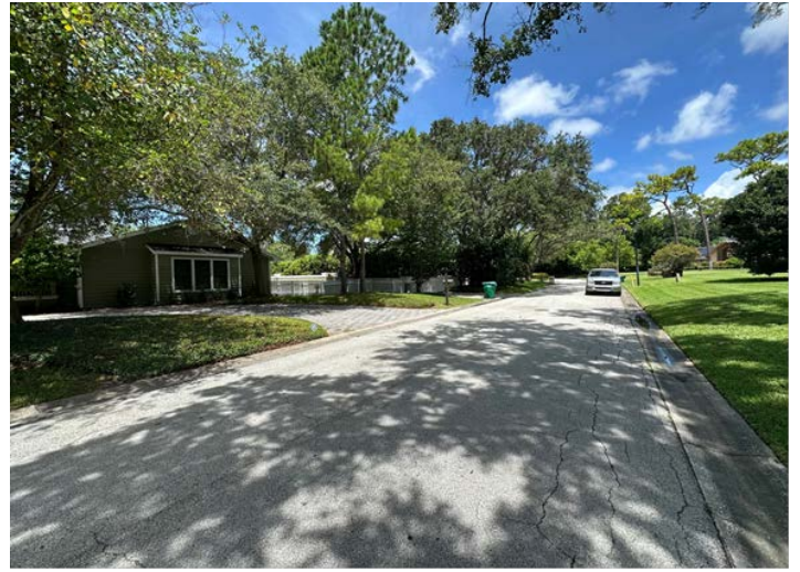
North of the subject property