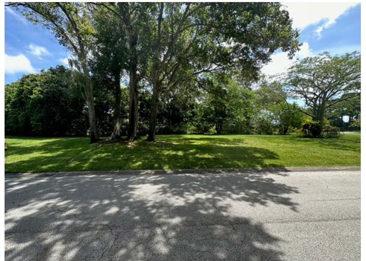
Across the street, to the east of the subject property