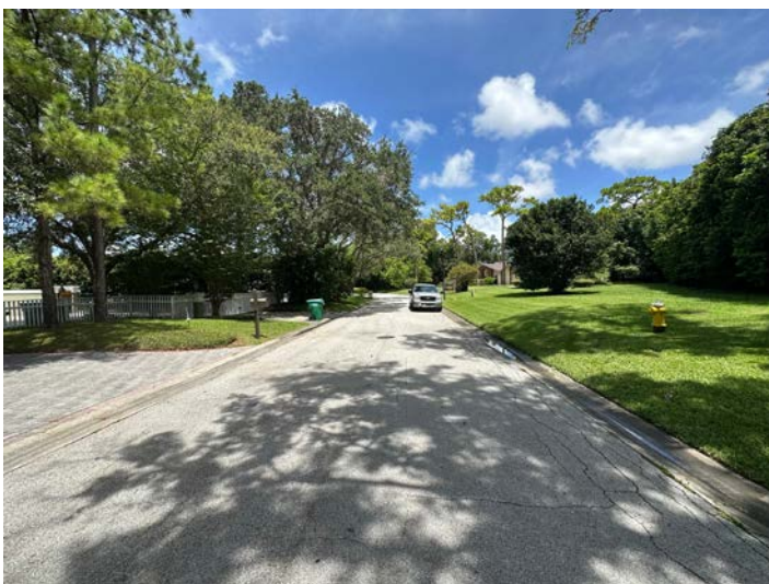
View looking northerly along McCauley Road