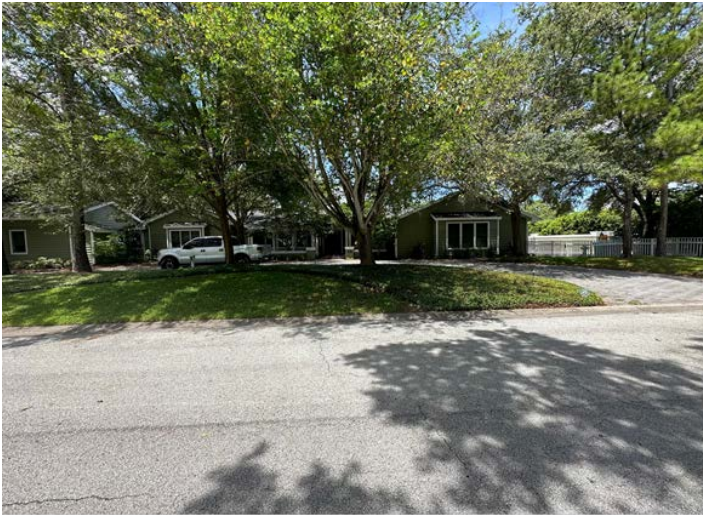
View looking west at subject property on McCauley Road