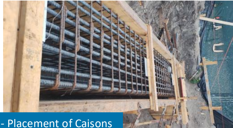
Below- Placement of Caisons