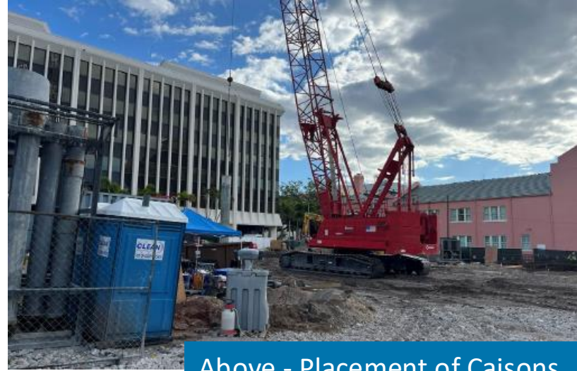
Above - Placement of Caisons