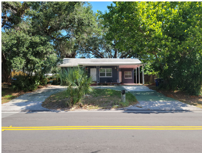
Across the street, to the north of the subject property