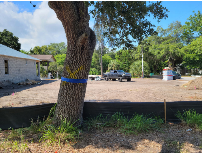
View looking south at subject property 1219 Sunset Point Road