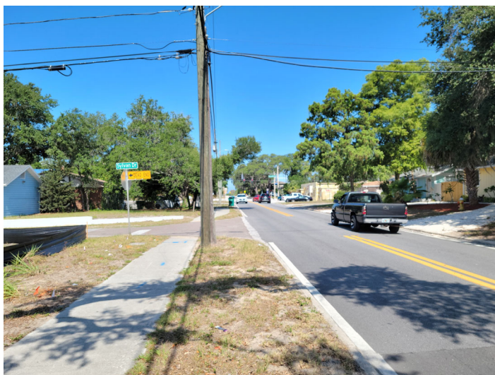
View looking westerly along Sunset Point Road

ANX2022-05008 Weekley Homes, LLC 1219 Sunset Point Road