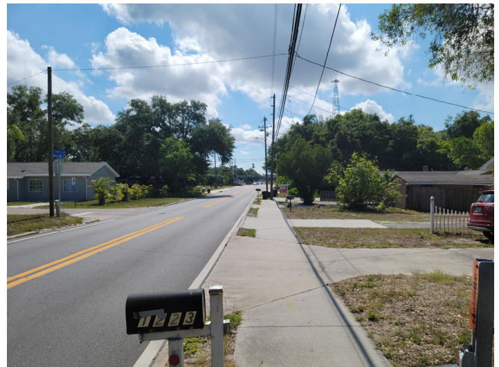
View looking easterly along Sunset Point Road