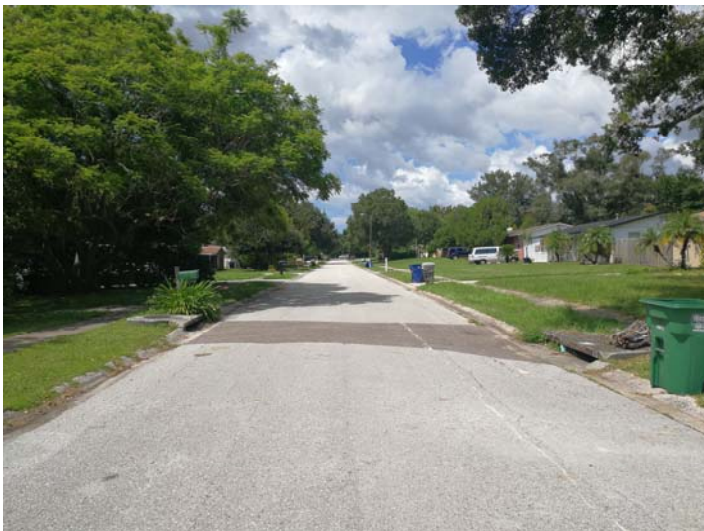
View looking northerly along West Virginia Lane