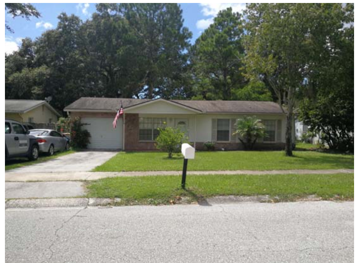
West of subject property, across West Virginia Lane