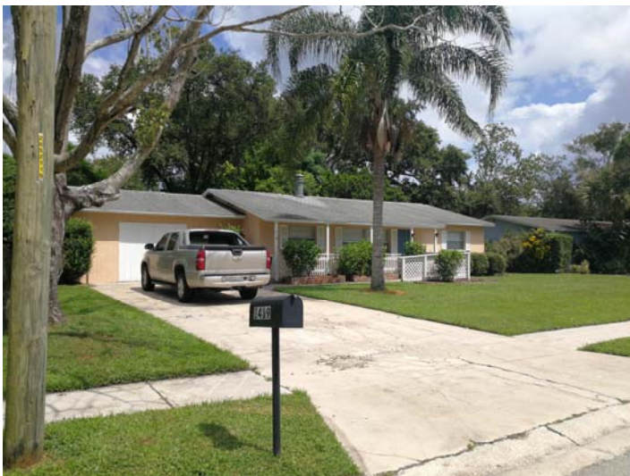
South of subject property