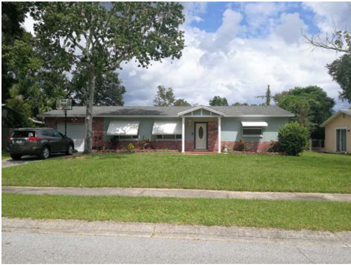
View looking east at subject property, 1421 W. Virginia Lane