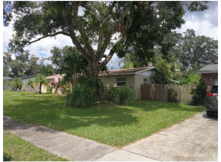
North of subject property