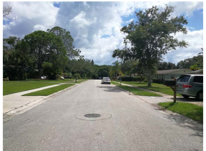
View looking southerly along West Virginia Lane

ANX2019-07015 Raquel & Roldan Q. Alabat 1421 West Virginia Lane