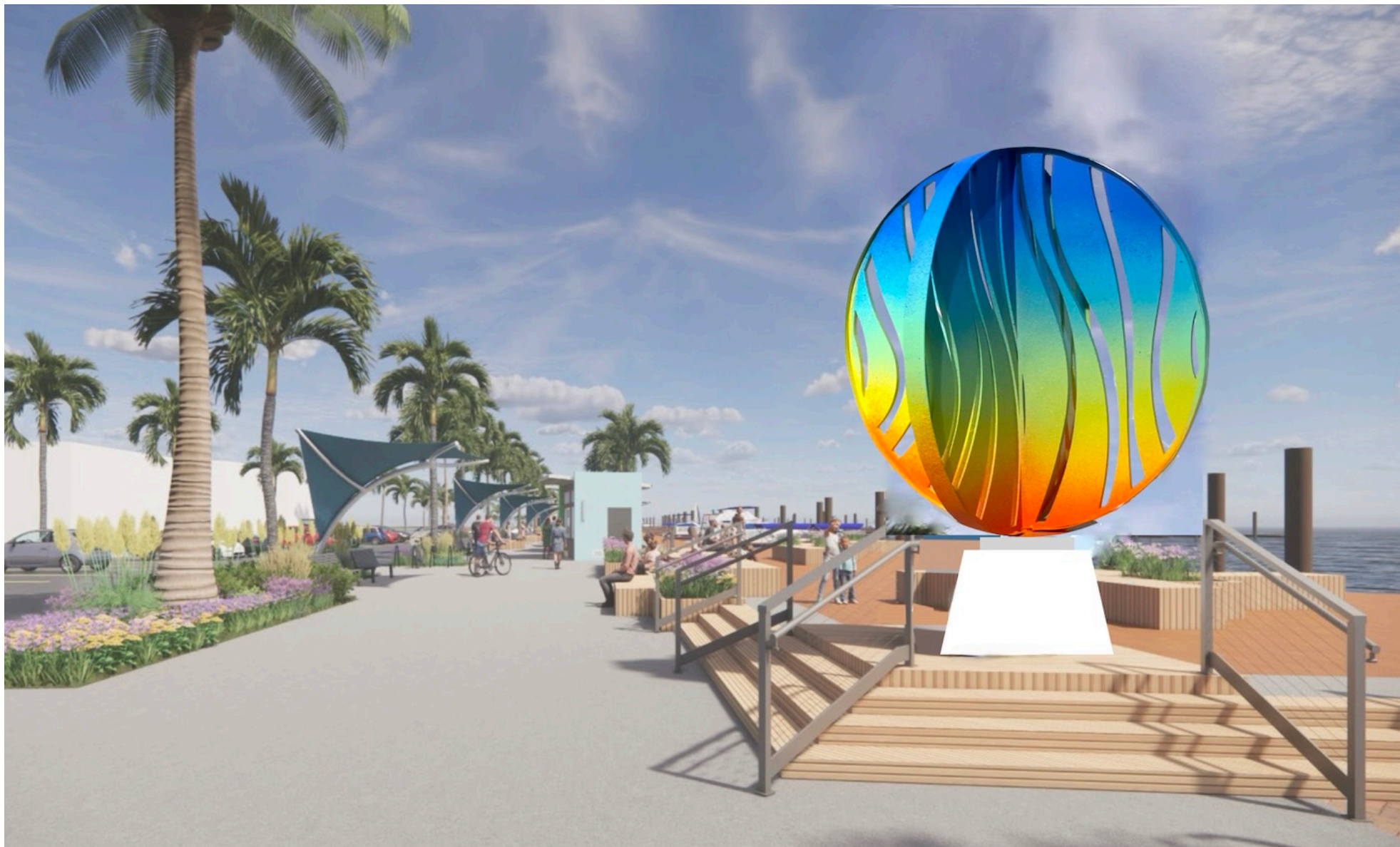
Cecilia Lueza Art Projects 2025