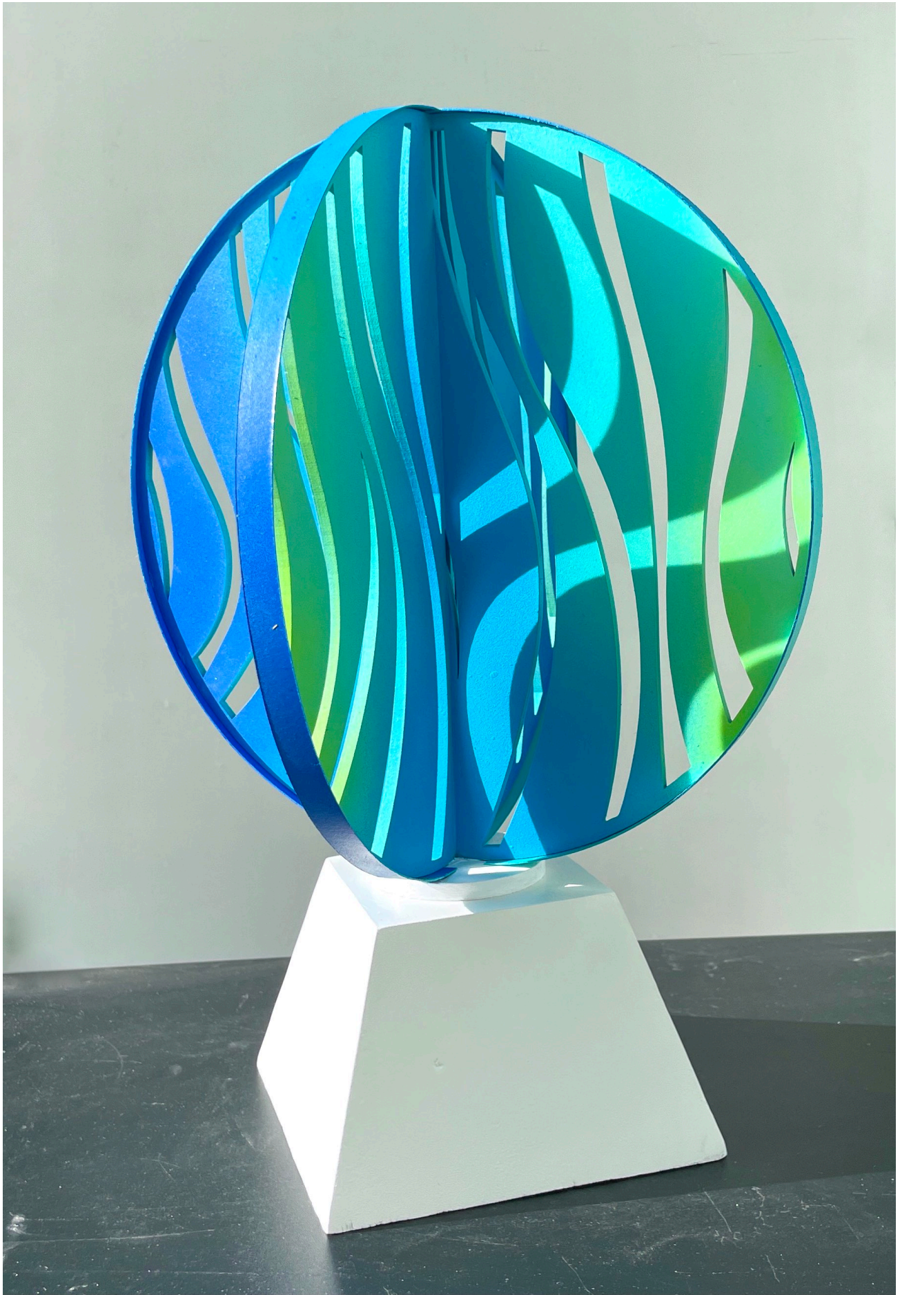
Cecilia Lueza Art Projects 2025