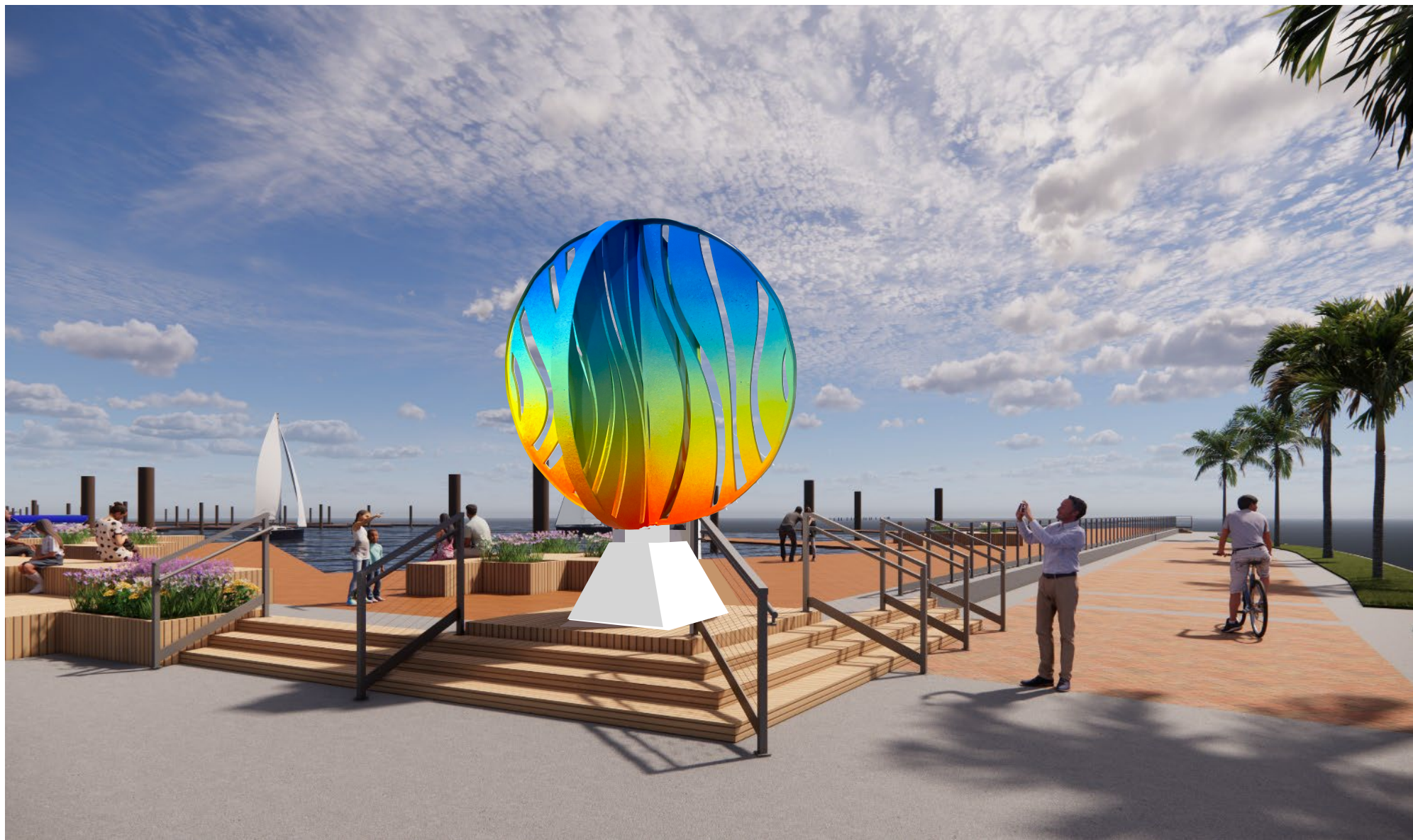
Cecilia Lueza Art Projects 2025