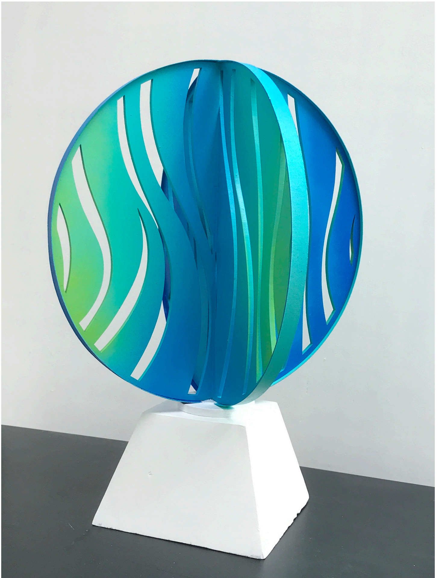
Cecilia Lueza Art Projects 2025