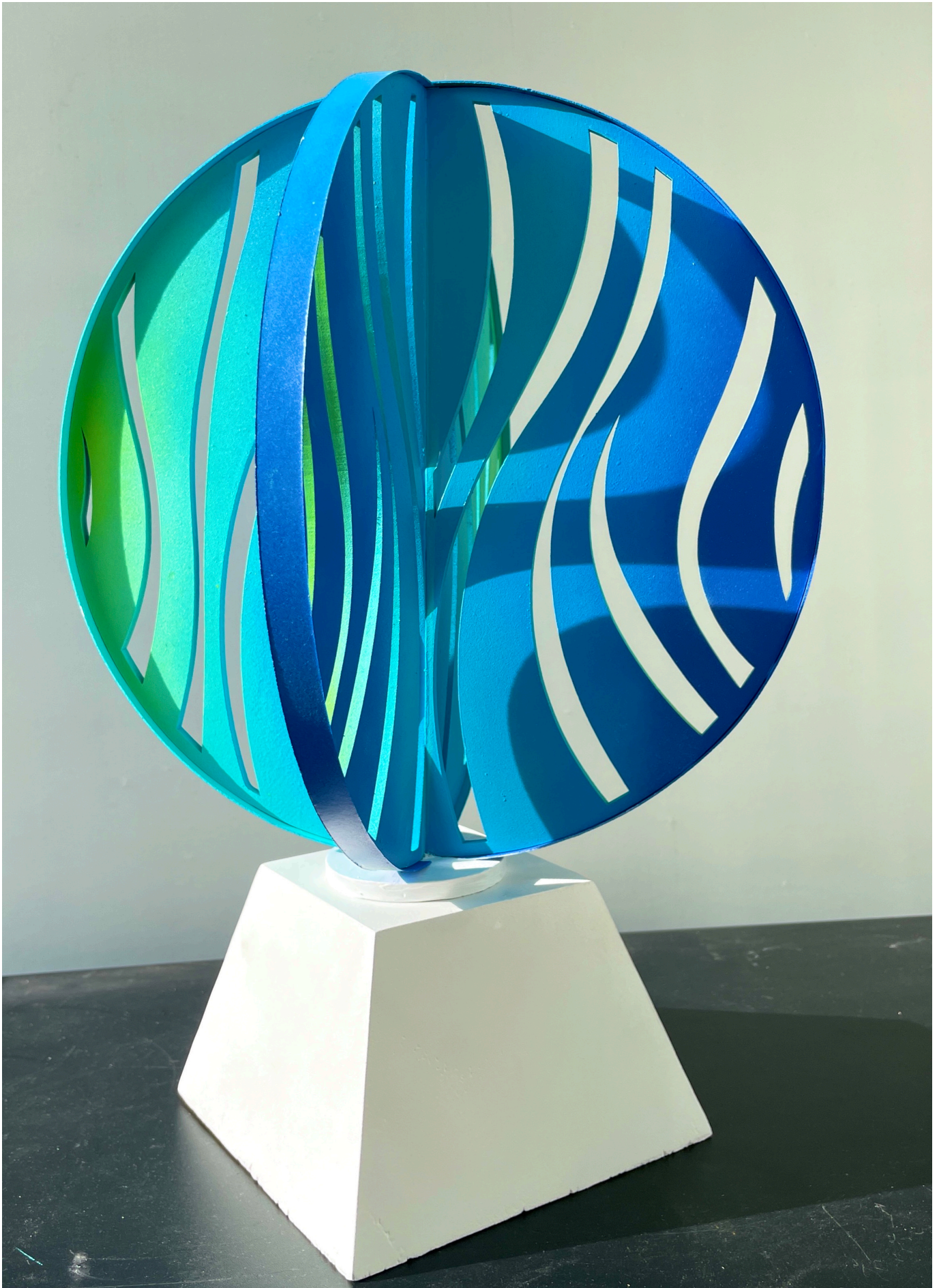
Cecilia Lueza Art Projects 2025