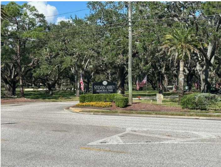
Across Sunset Point Road, facing north at the subject properties