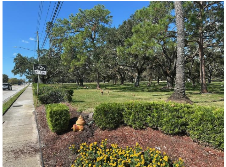
Facing west of the subject property, 2860 Sunset Point Road