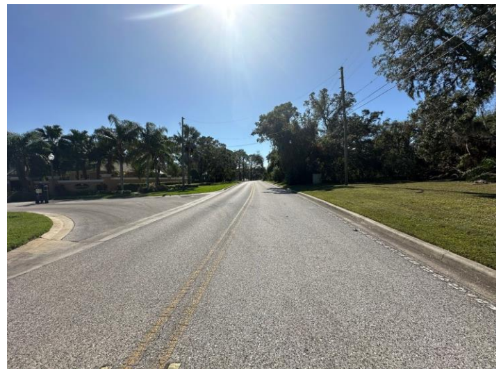
Facing south along County Road 193

ANX2024-09007 Sylvan Abbey Memorial Park Inc 2885 Sunset Point Road and Unaddressed Sunset Point Road