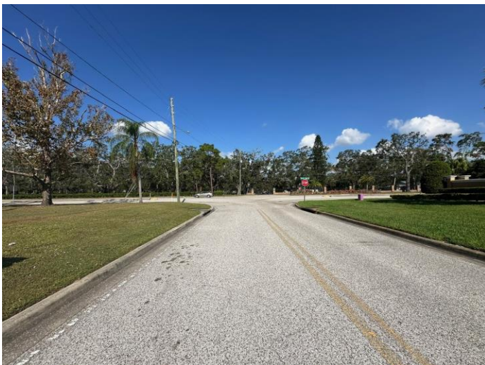
Facing north along County Road 193