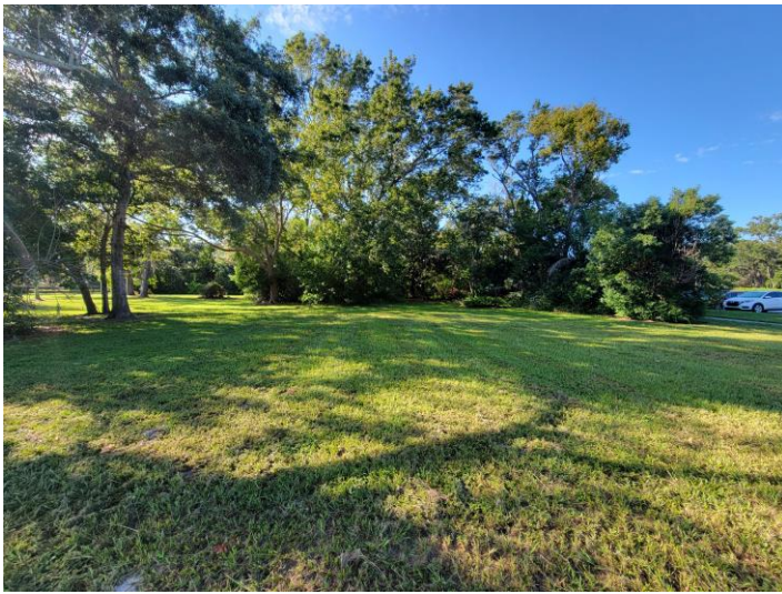
Facing south, looking at the subject properties