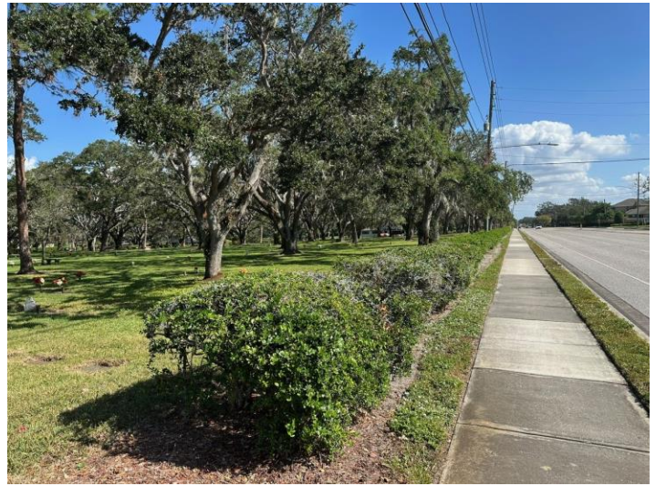
Facing east of the subject property, 2860 Sunset Point Road