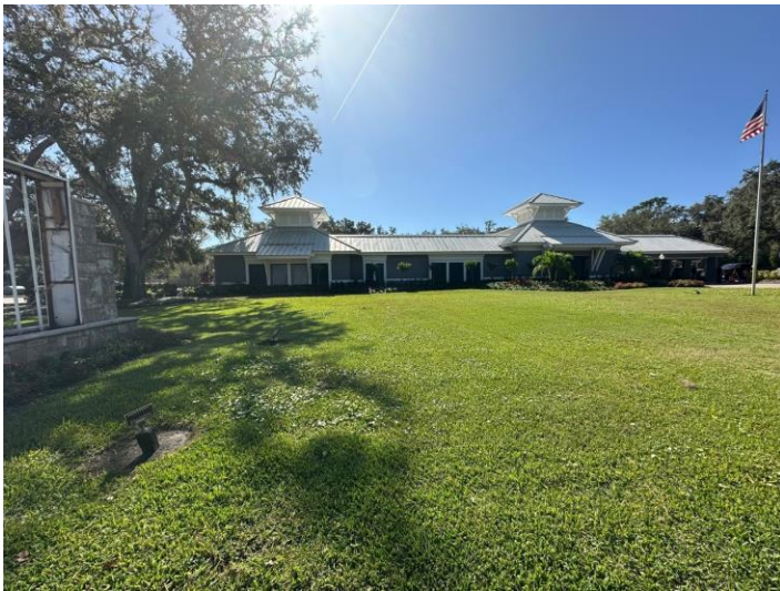
Across from Sunset Point Road, facing south of the subject property