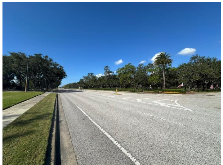
Facing west along Sunset Point Road

ANX2024-09007 Sylvan Abbey Memorial Park Inc 2860 Sunset Point Road