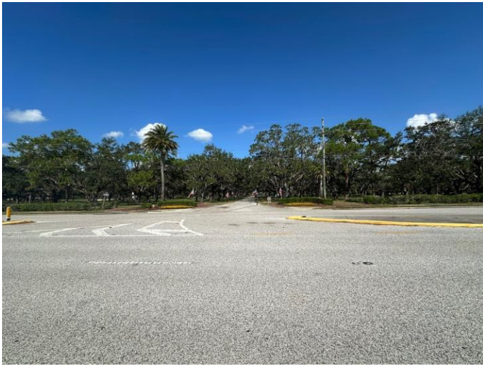
Facing north at the subject property, 2860 Sunset Point Road