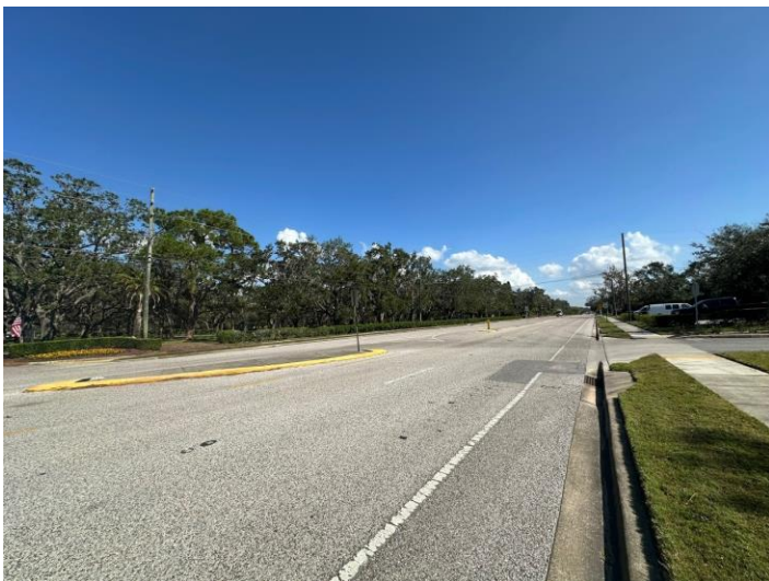
Facing east along Sunset Point Road