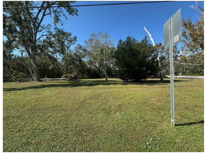
Facing west at the subject properties