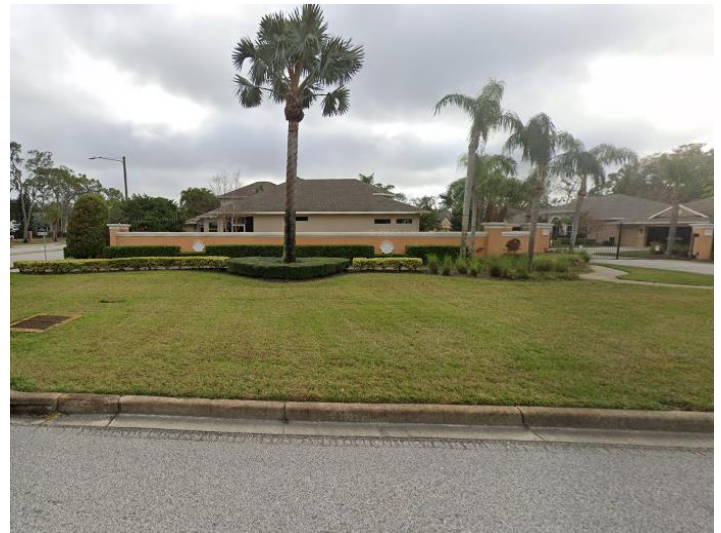
Facing east of the subject properties