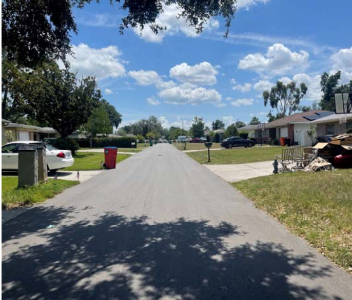
Facing west along Seabreeze Avenue

ANX2025-04004 Emre and Sevim Erin 1408 Seabreeze Avenue