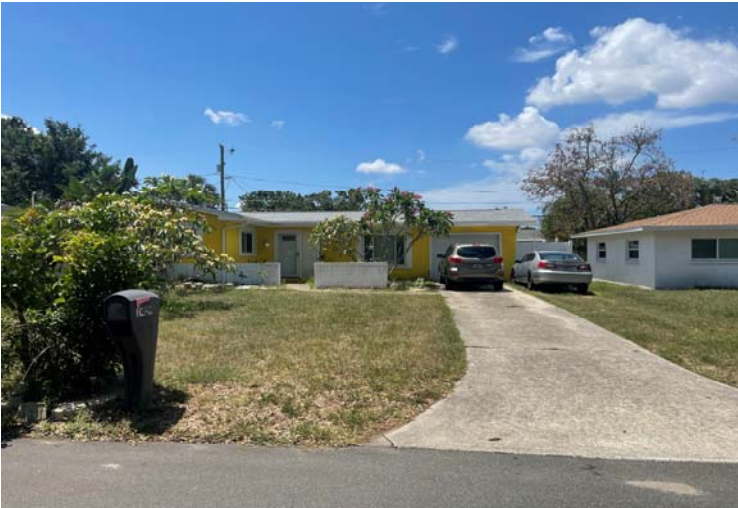
Facing south of the subject property along Seabreeze Avenue