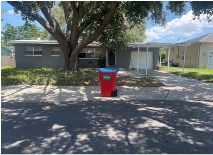
Facing north at the subject property, 1408 Seabreeze Avenue