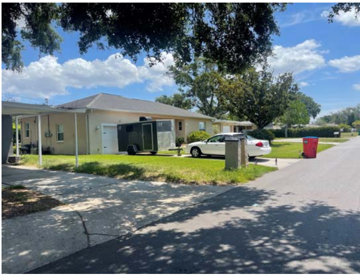
Facing east of the subject property along Seabreeze Avenue