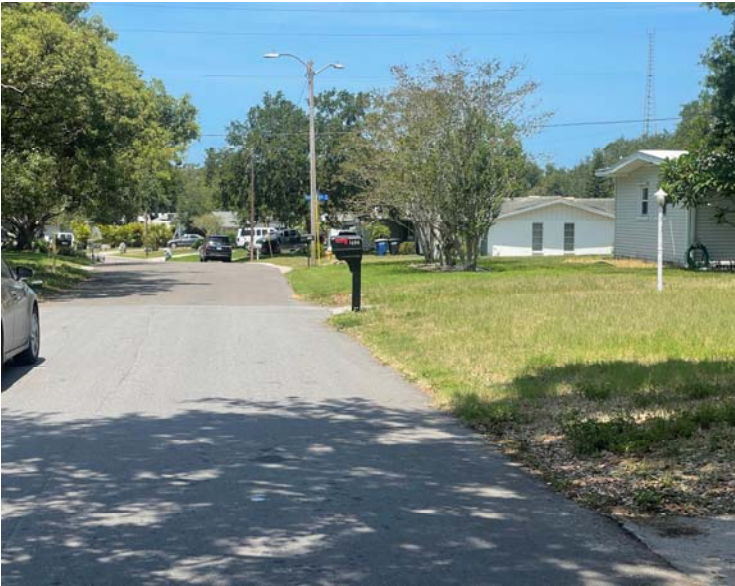
Facing east along Seabreeze Avenue