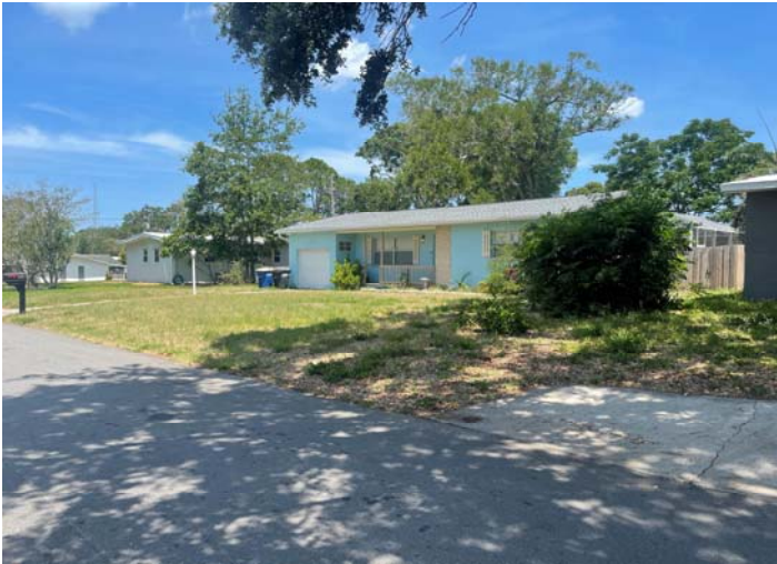
Facing west of the subject property along Seabreeze Avenue