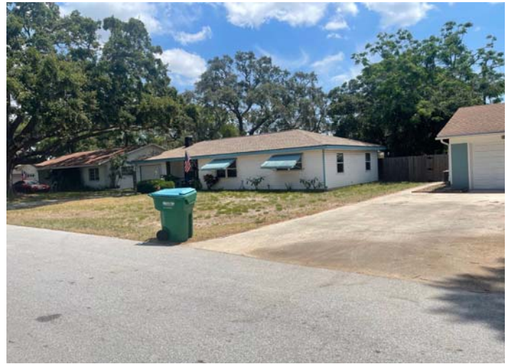
Facing north of the subject property along Ridge Avenue