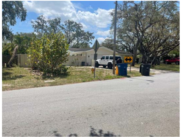
Facing south of the subject property along Ridge Avenue