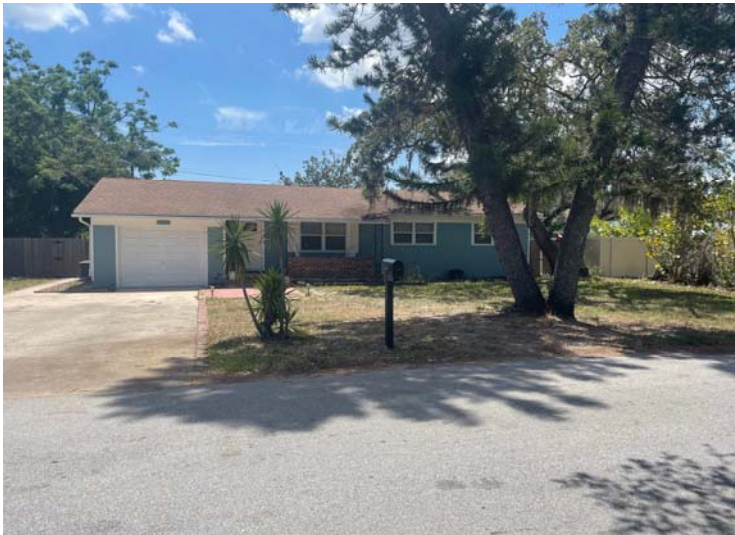
Facing east at the subject property, 1115 Ridge Avenue