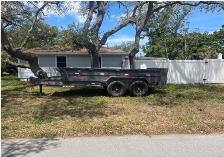
Facing west of the subject property along Ridge Avenue