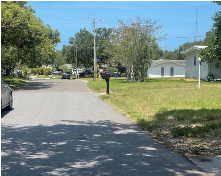
Facing west along Ridge Avenue