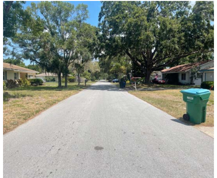
Facing north along Ridge Avenue