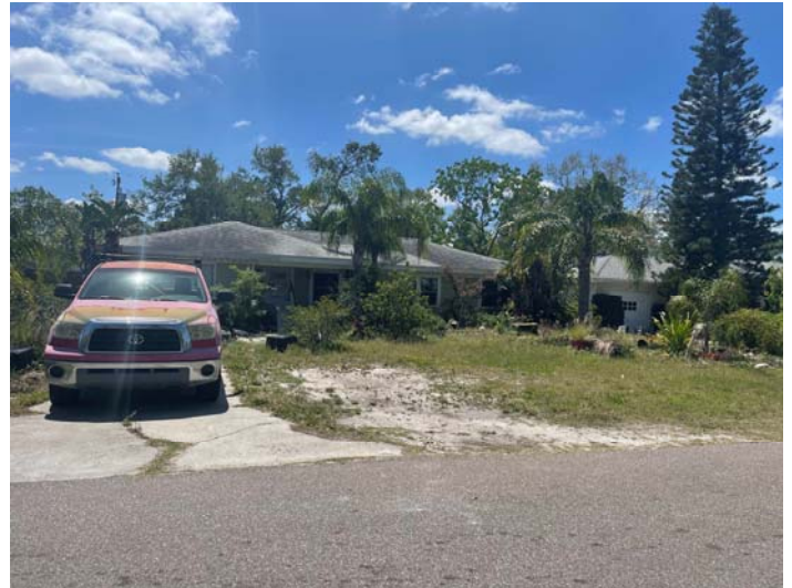
Facing west of the subject property along Levern Street