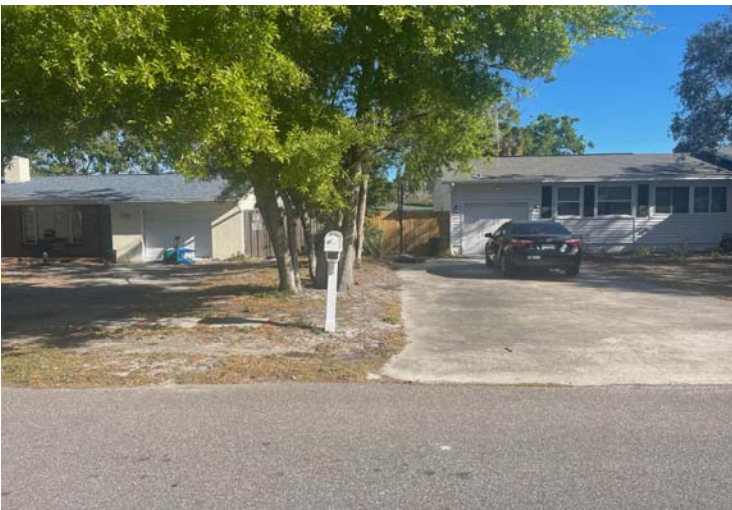
Facing the north of the subject property along Levern Street