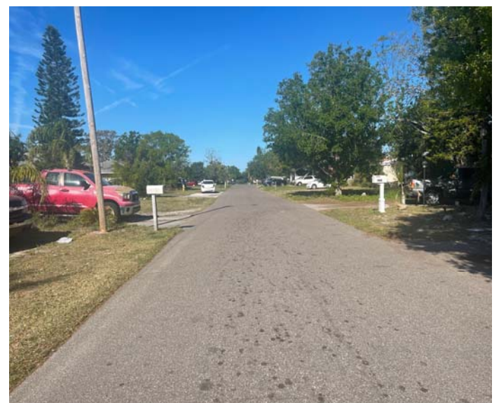
Facing west along Levern Street

ANX2025-03002 Cirila Portillo 1609 Levern Street