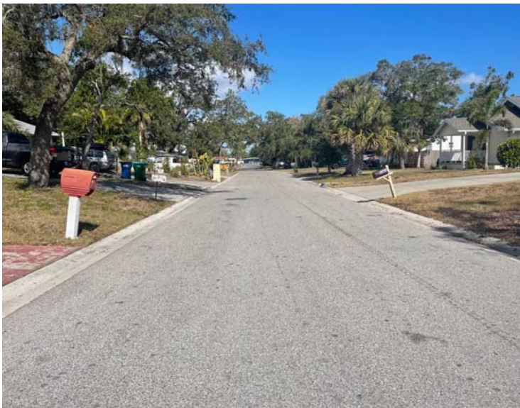
Facing east along Levern Street