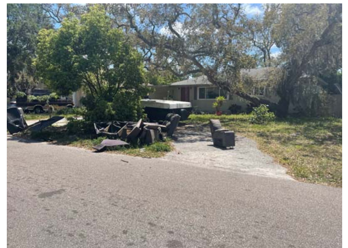
Facing east of the subject property along Levern Street