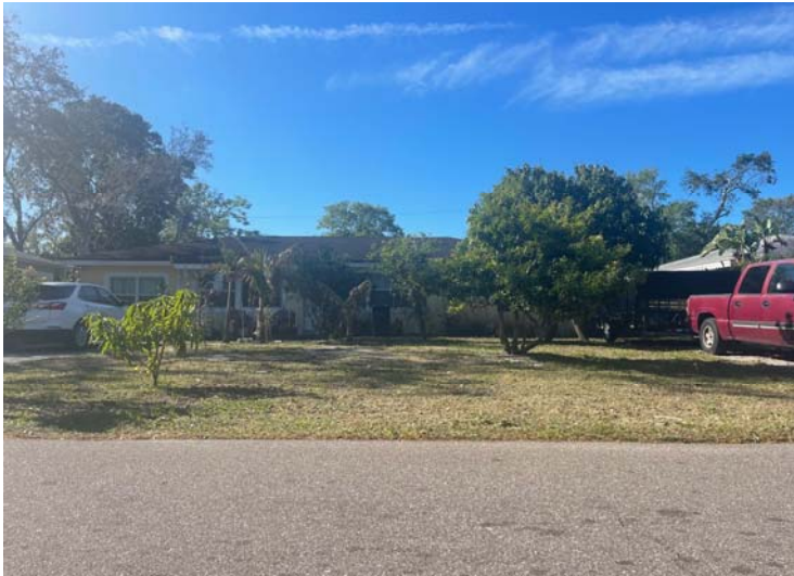
Facing south at the subject property, 1609 Levern Street