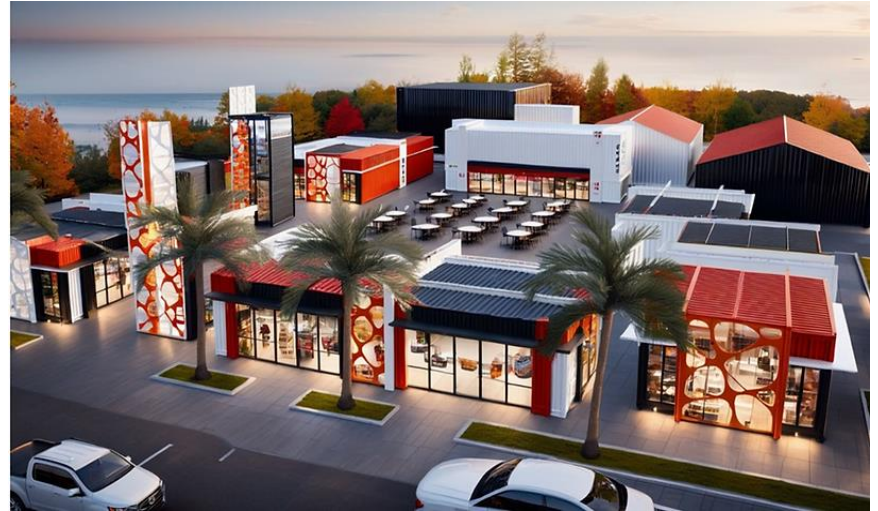
Concept Rendering provided by CULC