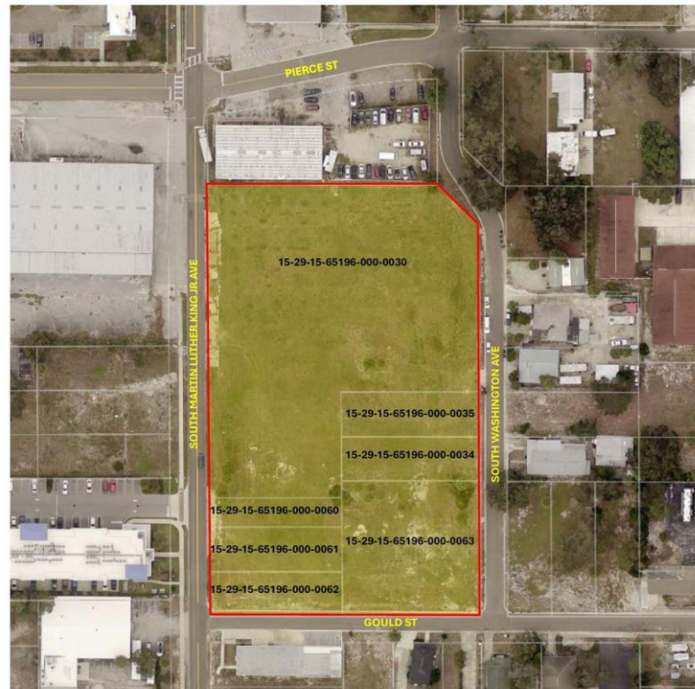
WASHINGTON/MLK DEVELOPMENT SITE