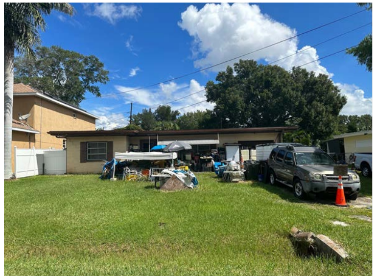
Across the street, to the north of the subject property