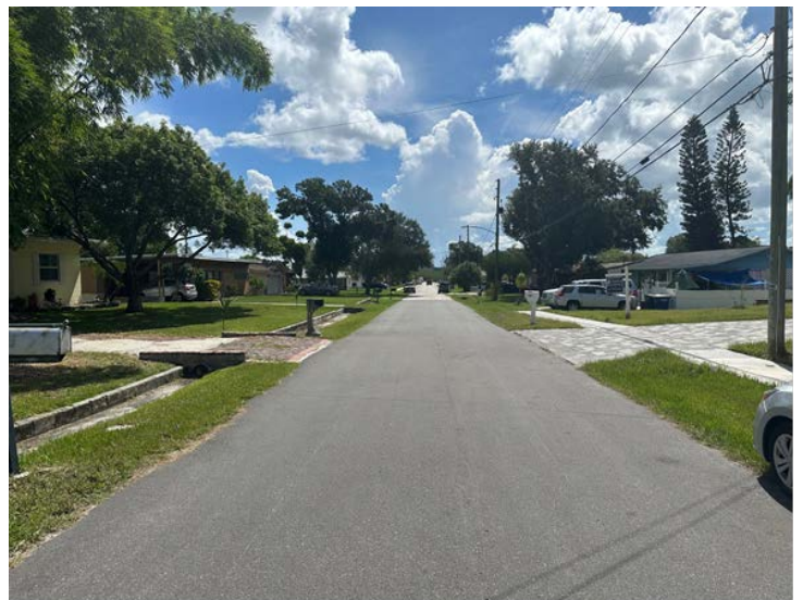
View looking easterly along Downing Street

ANX2023-07008 Father Silas and Hend Andrew 3121 Downing Street