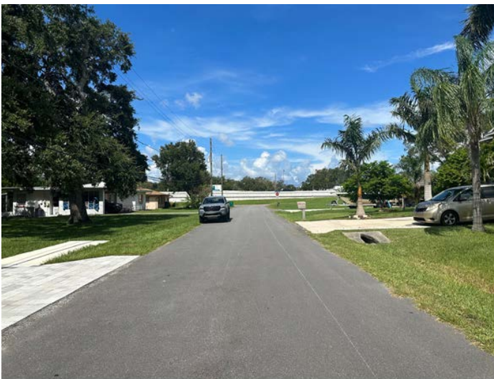
View looking westerly along Downing Street