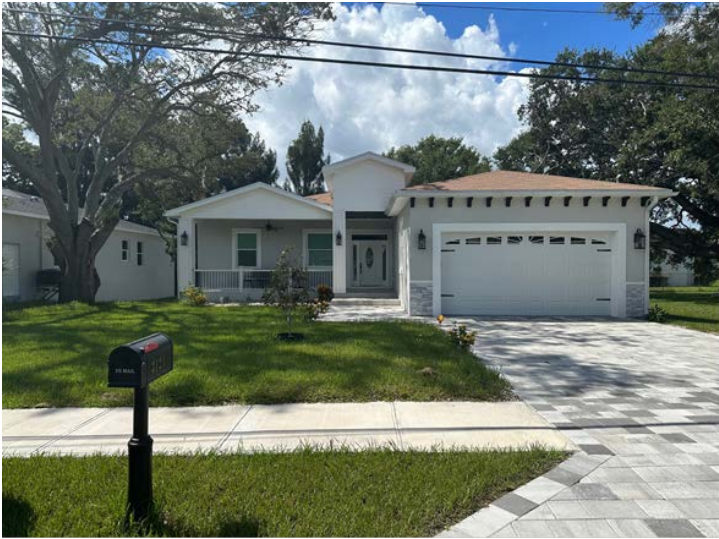
View looking south at subject property on Downing Street