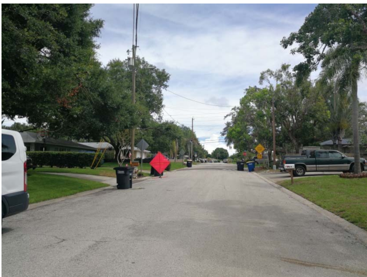
View looking northerly along Audubon Street