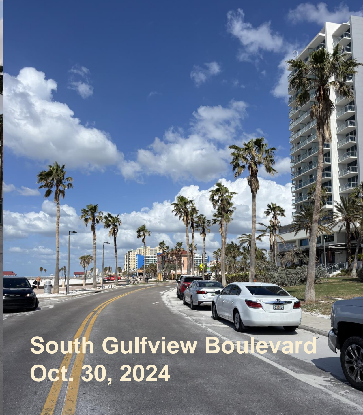
South Gulfview Boulevard Oct. 30, 2024