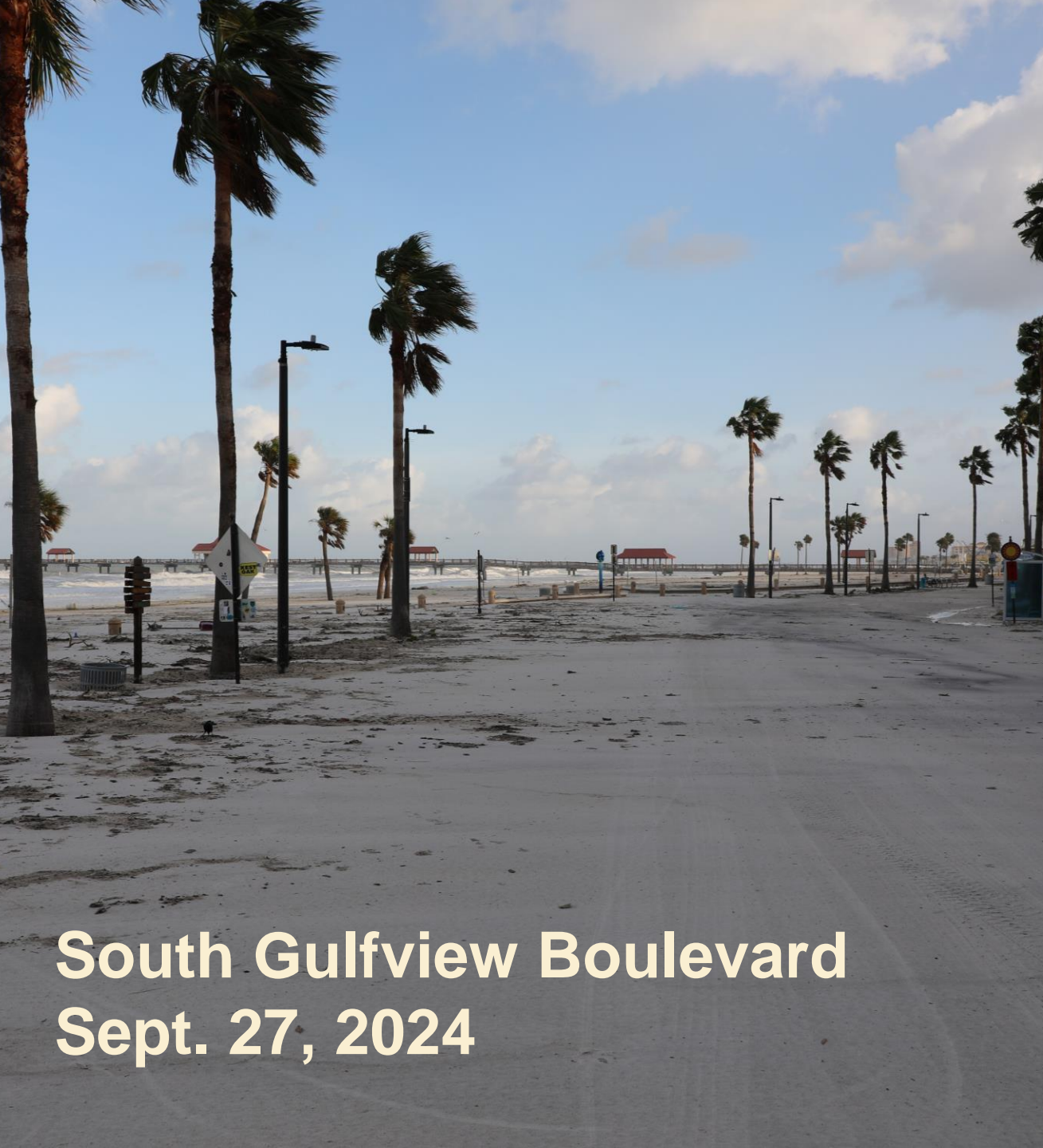
South Gulfview Boulevard Sept. 27, 2024