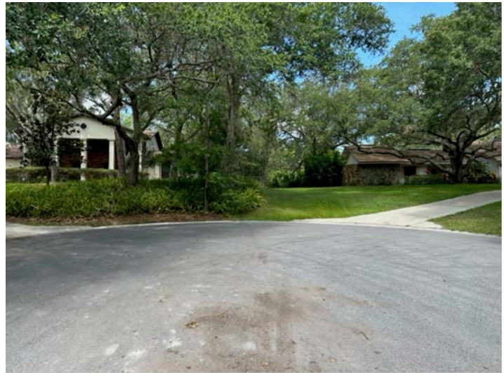
View looking westerly along Tanglewood Drive

ANX2023-05005 Deborah E. Orsi Unaddressed Tanglewood Drive