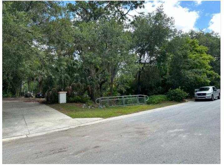
East of the subject property