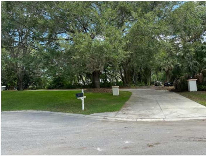
View looking north at subject property on Tanglewood Drive