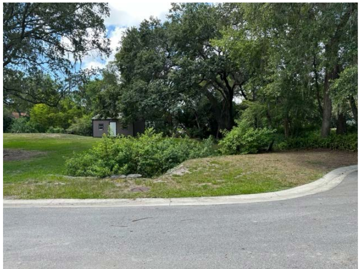
Across the street, to the south of the subject property