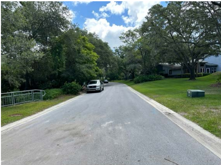
View looking easterly along Tanglewood Drive