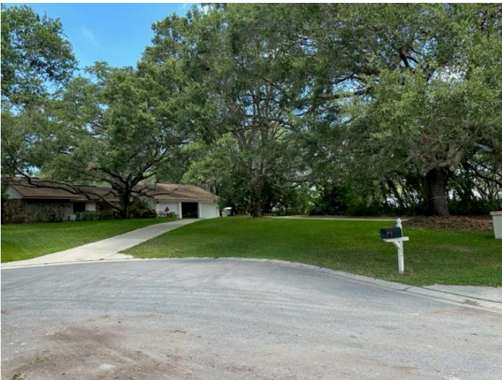
West of the subject property