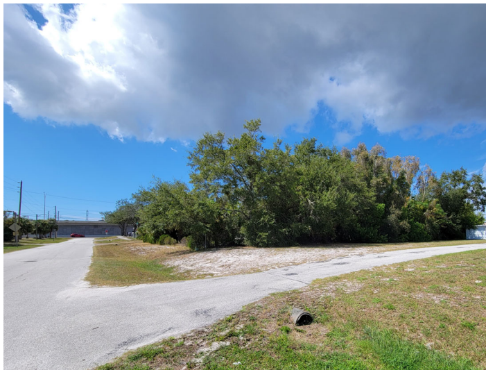
West of the subject property