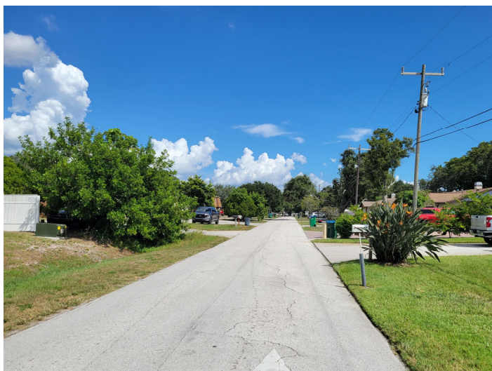
View looking easterly along South Drive