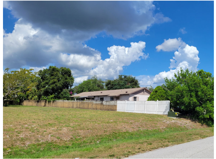
East of the subject property