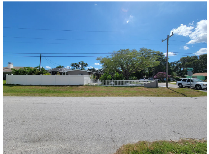
Across the street, to the south of the subject property