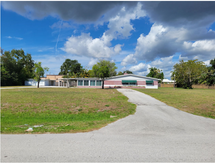
View looking north at subject property 2634 South Drive