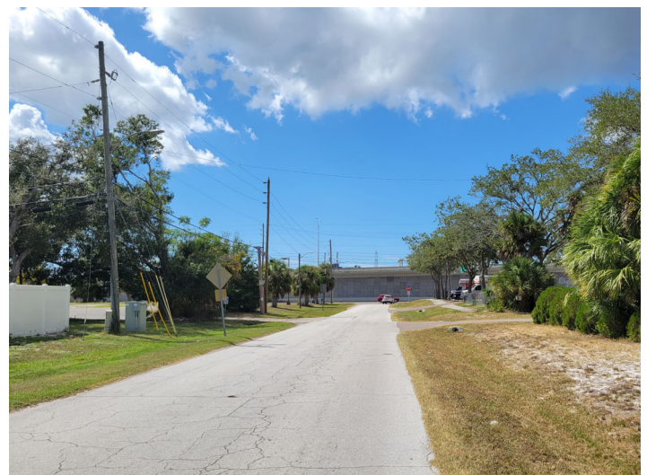
View looking westerly along South Drive

ANX2023-09010 Restoring Tampa Bay, LLC 2634 South Drive