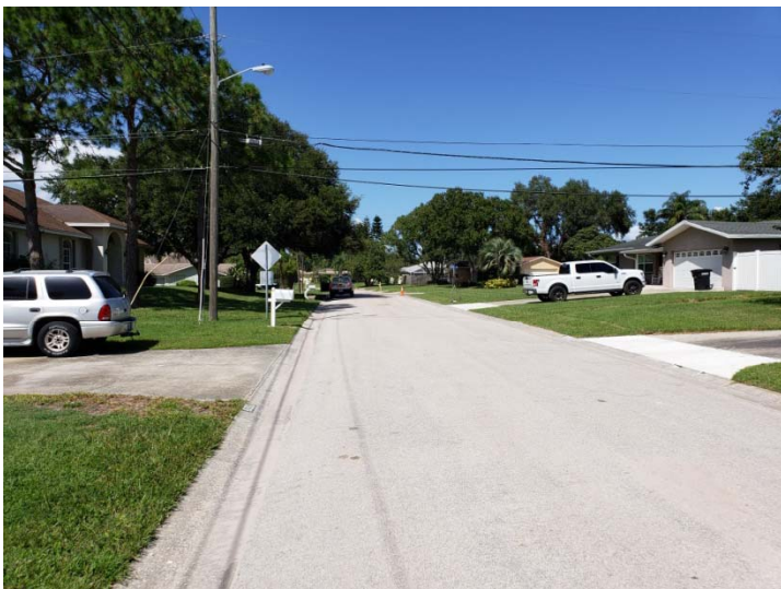
View looking northerly along Moss Avenue