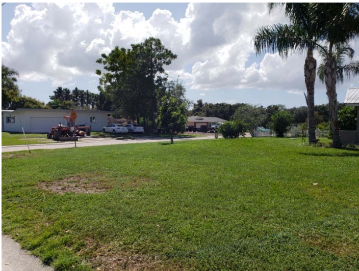
South of the subject property