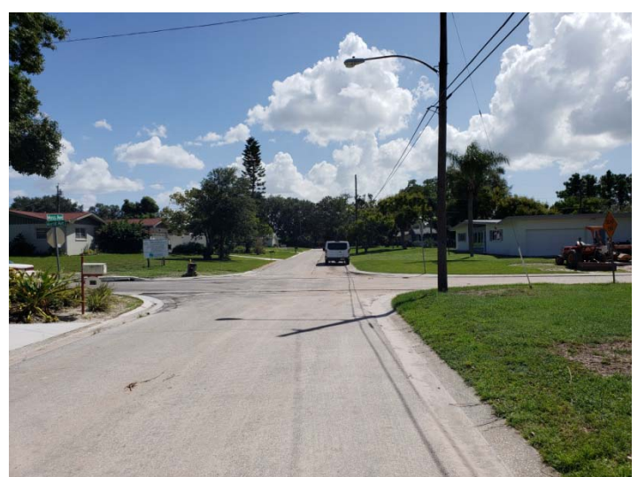
View looking southerly along Moss Avenue