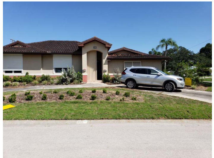
Across the street, to the east of the subject property