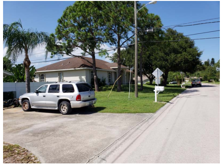
North of the subject property