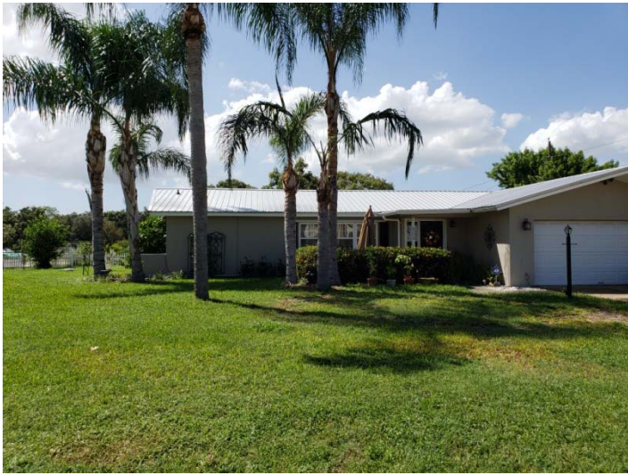
View looking west at the subject property 600 Moss Avenue