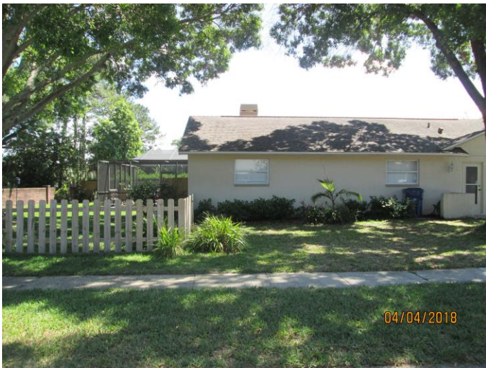
South of the subject property, on Aspen Trail