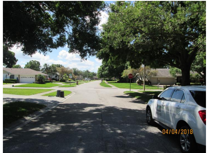
View looking southerly along Aspen Trail