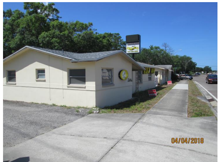
West of the subject property, on Curlew Road