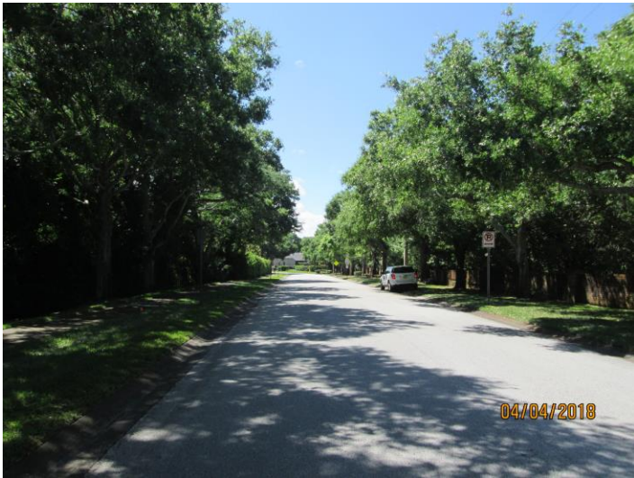
View looking southerly along Lake Shore Lane