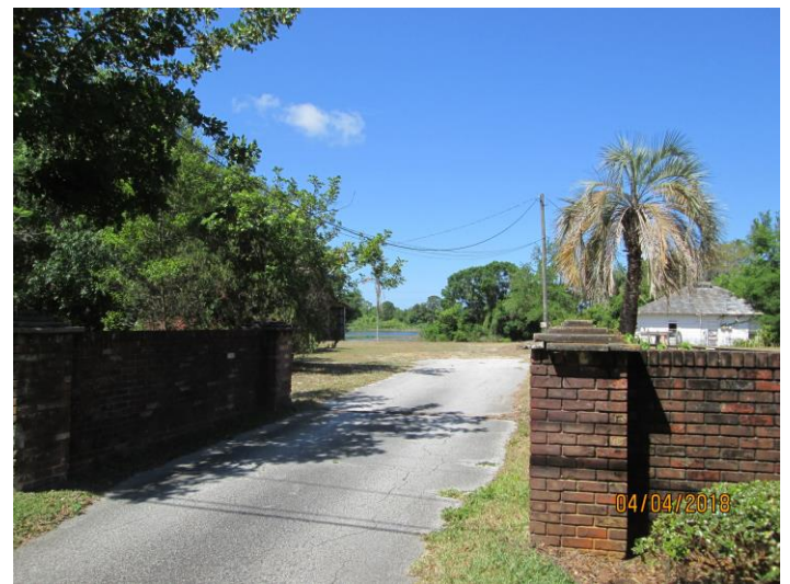
View looking west at the subject property from Lake Shore Lane