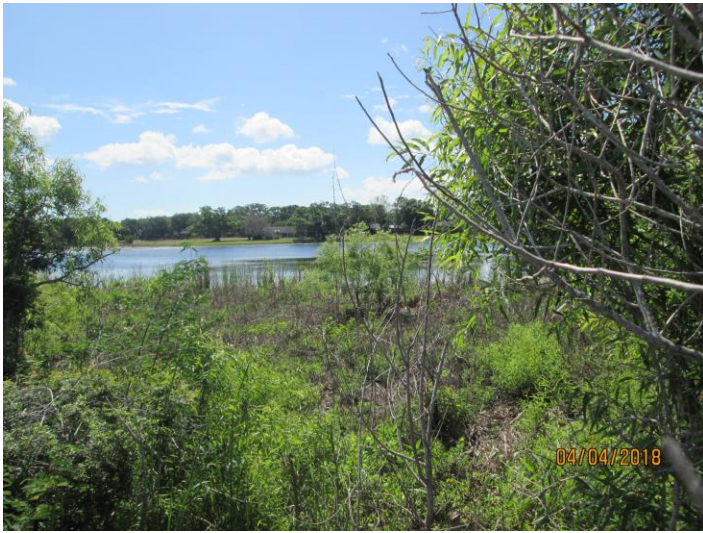
View looking south at the subject property, 3474 Aspen Trail, from Curlew Road