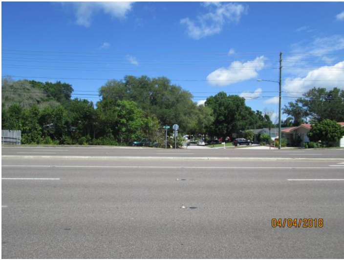
North of the subject property, across Curlew Road