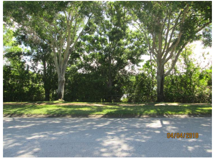
East of the subject property, across Lake Shore Lane