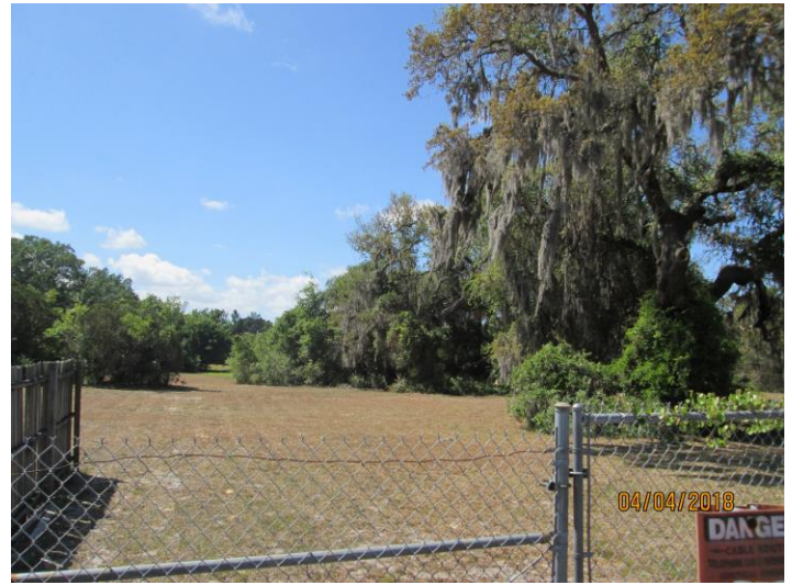
View looking south at the subject property's western boundary (utility easement) from Curlew Road