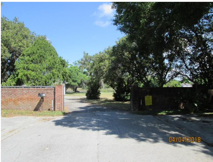
View looking north at the subject property from Aspen Trail