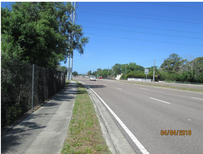
View looking westerly along Curlew Road