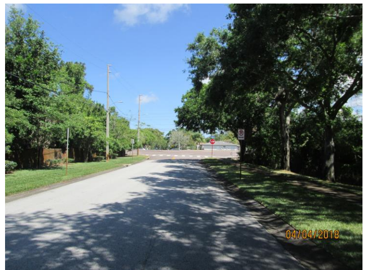
View looking northerly along Lake Shore Lane