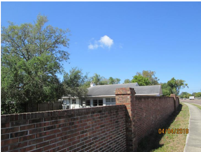
View looking southwesterly at the subject property's northeastern corner from Curlew Road