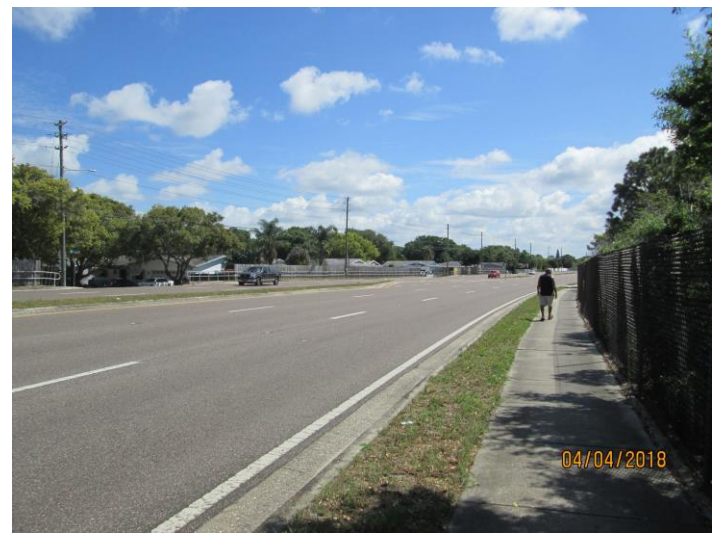
View looking easterly along Curlew Road