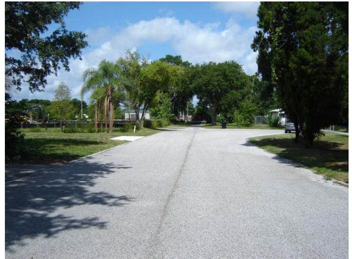
View looking westerly along Cleveland St