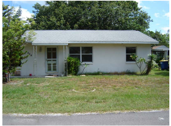
View looking north at the subject property, 3054 Cherry Ln.