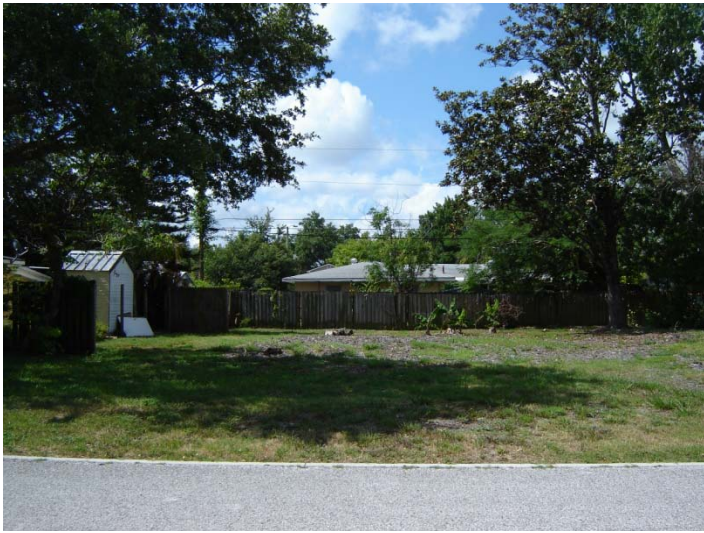
View looking south at the subject property, 3049 Cleveland St.