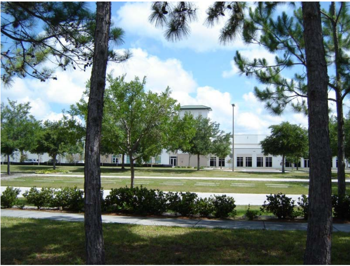
Looking across Cleveland Street, north of the subject properties

LUP2014-04001 & REZ2014-04001 City of Clearwater – Calvary Baptist Church 3049 and 3053 Cleveland Street