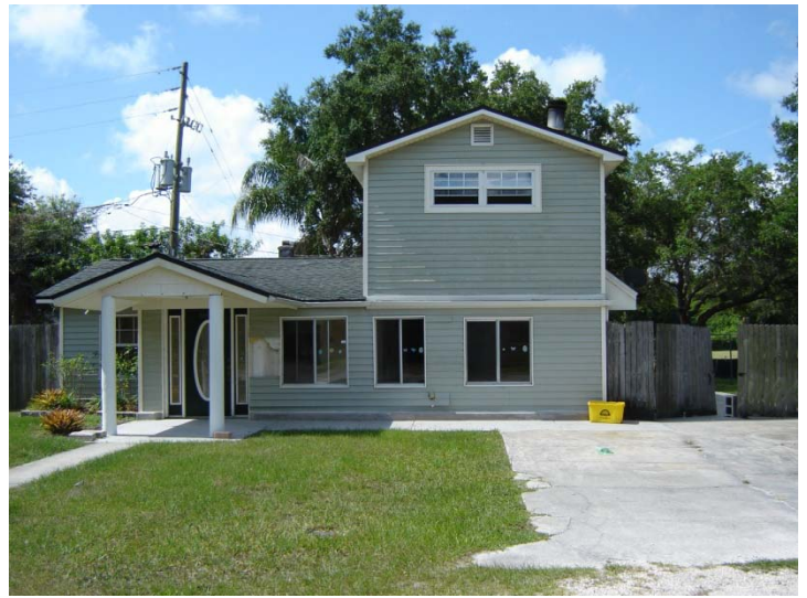
Across the street, south of 3054 Cherry Ln.

LUP2014-04001 & REZ2014-04001 City of Clearwater – Calvary Baptist Church 3048 and 3054 Cherry Lane