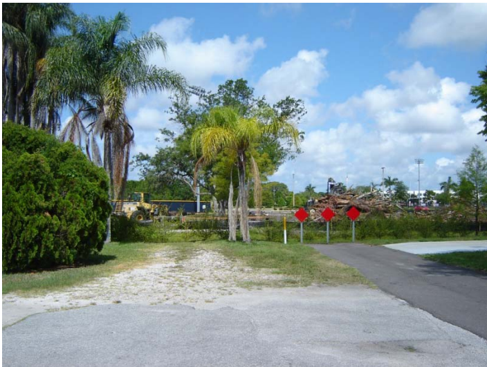
View looking easterly along Cherry Ln.