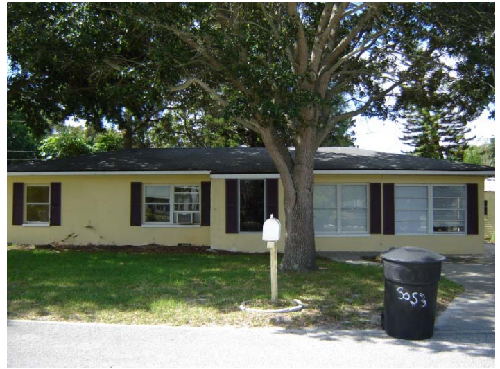
View looking south at the subject property, 3053 Cleveland St.