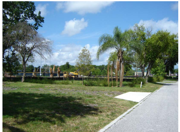
Adjacent property west of 3049 Cleveland St.

LUP2014-04001 & REZ2014-04001 Multiple Owners– Calvary Baptist Church 3049 and 3053 Cleveland Street