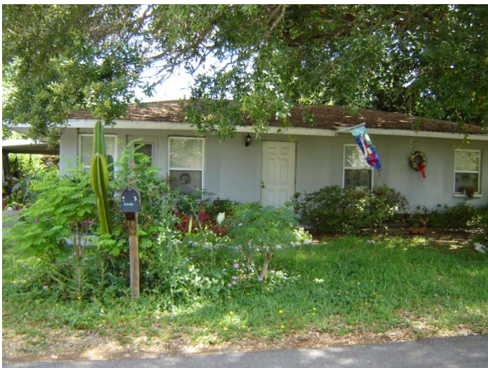
Adjacent property east of 3054 Cherry Ln.