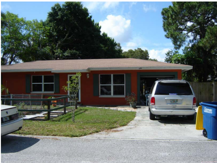
Adjacent property east of 3053 Cleveland St.