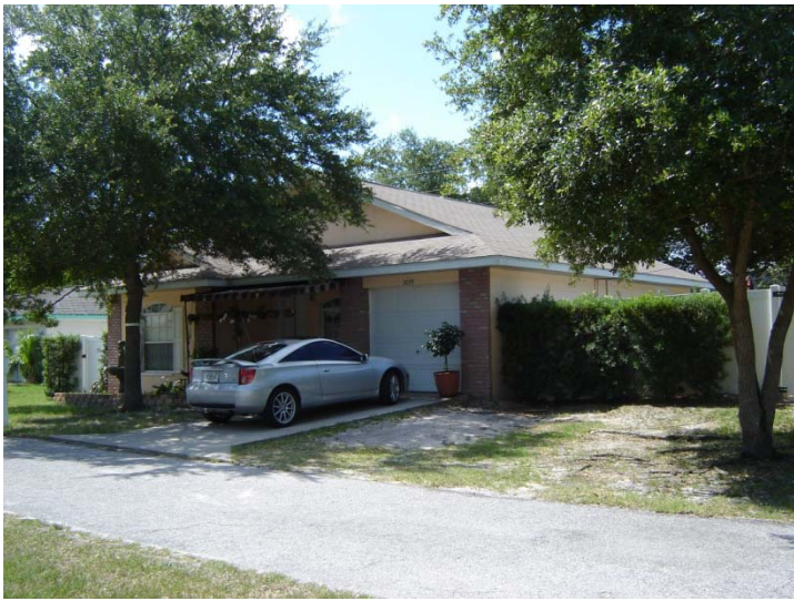
Adjacent the street, south of 3048 Cherry Ln.