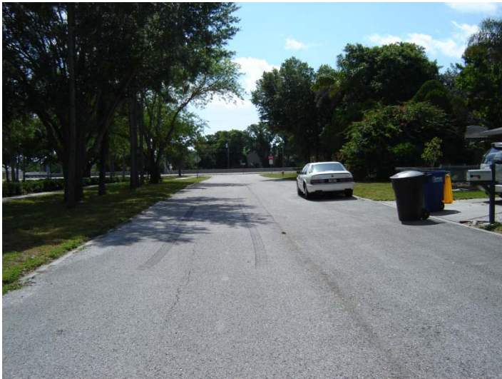
View looking easterly along Cleveland St.