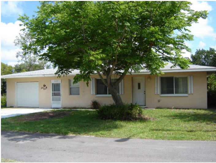
View looking north at the subject property, 3048 Cherry Ln.