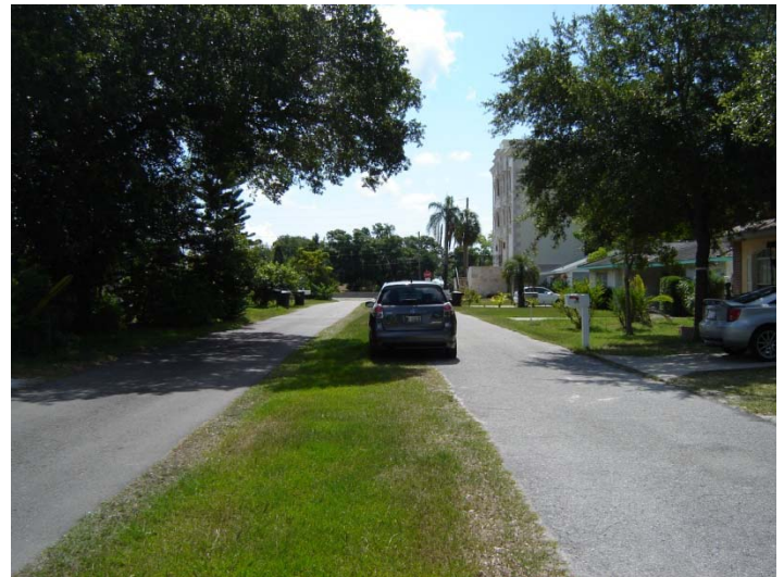
View looking westerly along Cherry Ln.