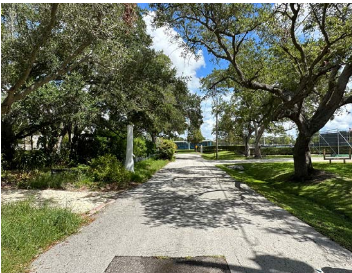
View looking northerly along Meadow Lark Lane