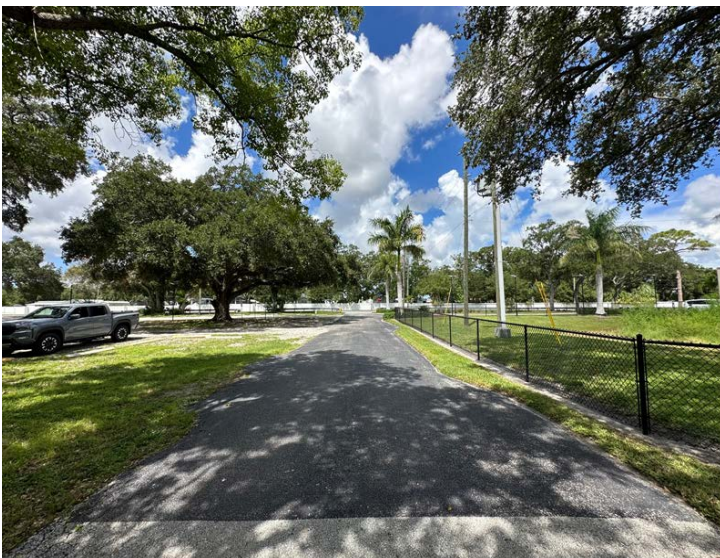
View looking westerly along Kentucky Avenue