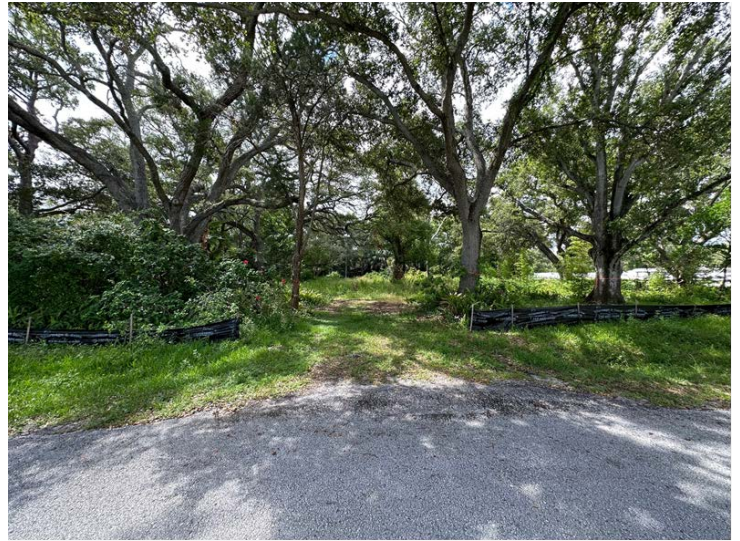
View looking south at subject property on Kentucky Avenue