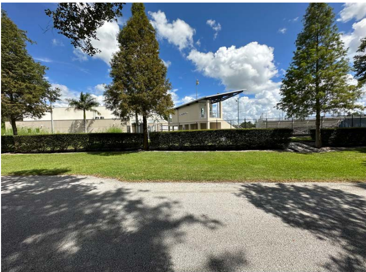
Across the street, to the north of the subject property