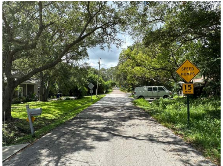
View looking southerly along Meadow Lark Lane

ANX2023-06007 First Baptist Church of Clearwater, Inc. Unaddressed Parcel on Meadow Lark Lane