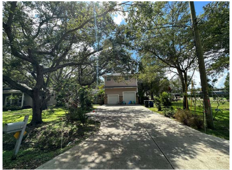
Across the street, to the east of the subject property