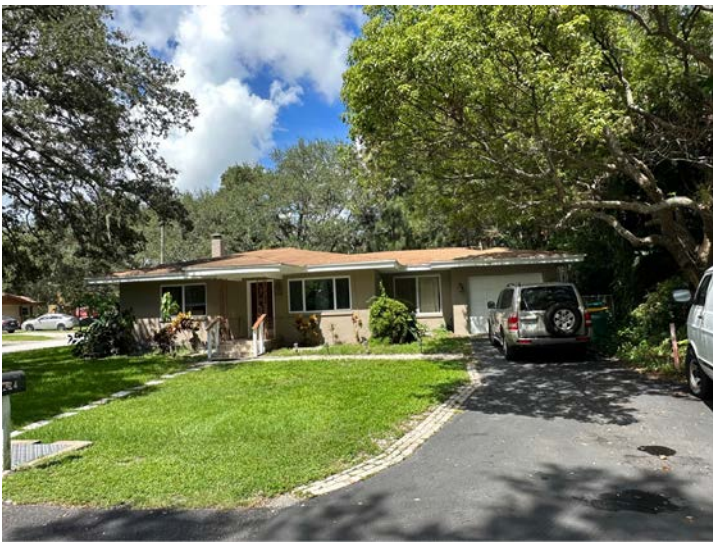
South of the subject property