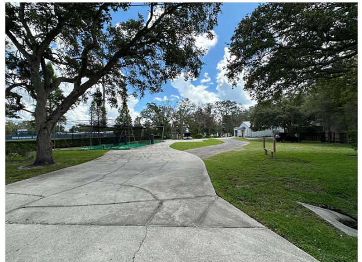
Across the street, to the east of the subject property