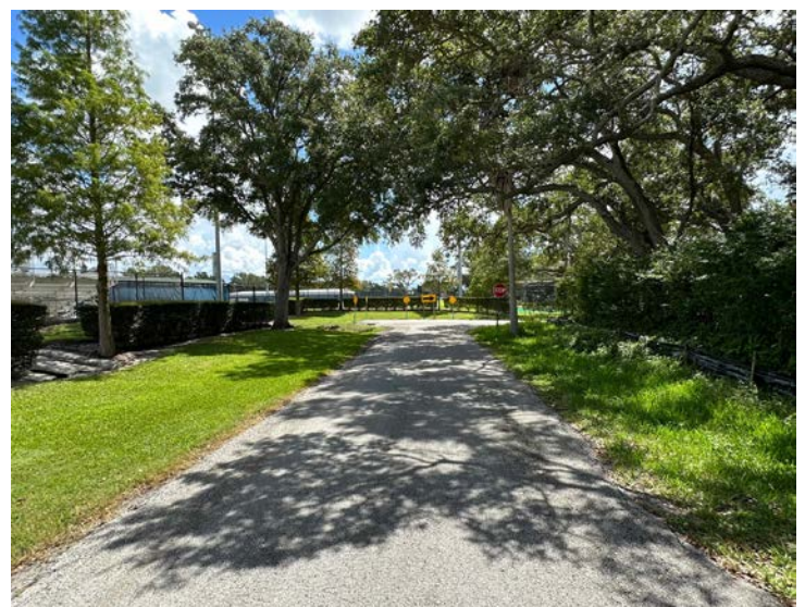
View looking easterly along Kentucky Avenue

ANX2023-06007 First Baptist Church of Clearwater, Inc. 210 Meadow Lark Lane