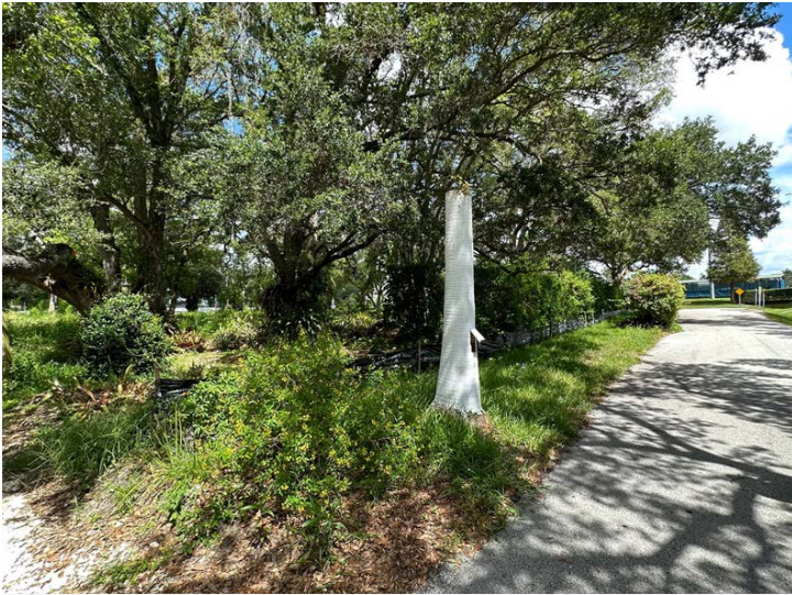
View looking northwest at subject property on Meadow Lark Lane