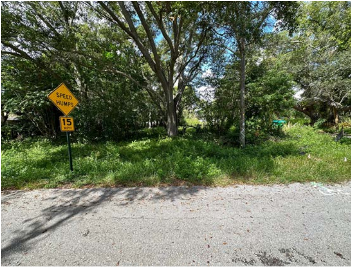
View looking west at subject property on Meadow Lark Lane