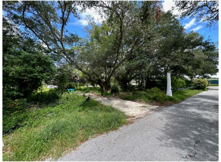
North of the subject property