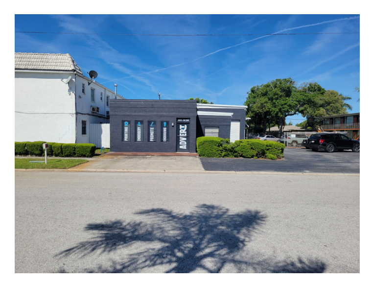
Across S Saturn Avenue to the west

LUP2024-02001/REZ2024-02001 St. Paul's Lutheran Church, Inc. 407 S Saturn Avenue