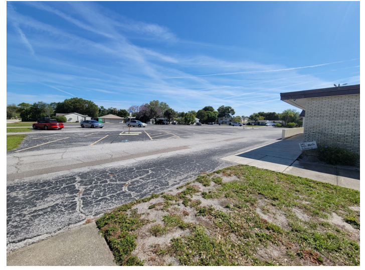
View looking northeast at the subject property