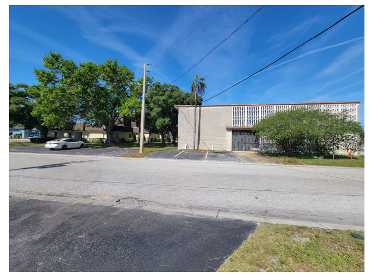
View looking west at the subject property