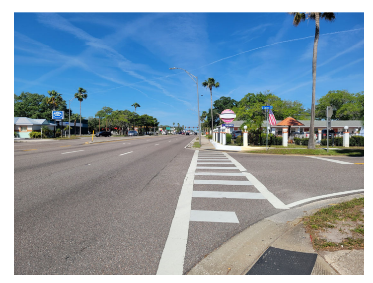
View looking westerly along Gulf to Bay Boulevard

LUP2024-02001/REZ2024-02001 St. Paul's Lutheran Church, Inc. 407 S Saturn Avenue