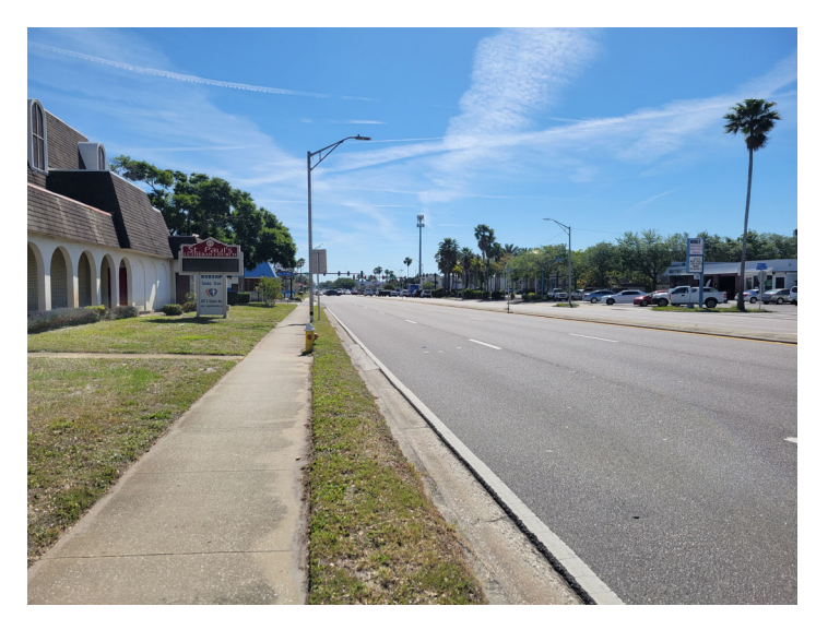
View looking easterly along Gulf to Bay Boulevard