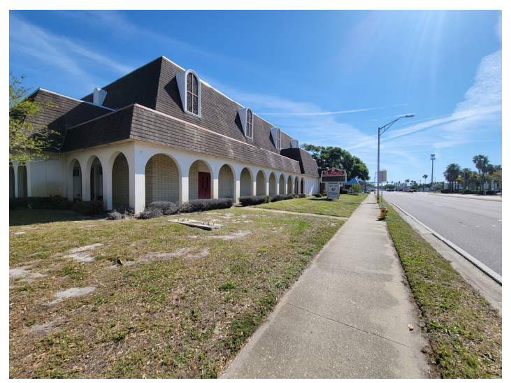
View looking northeast at the subject property from Gulf to Bay Boulevard