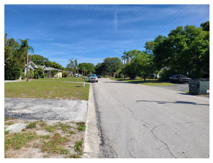
View looking northerly along S Mars Avenue