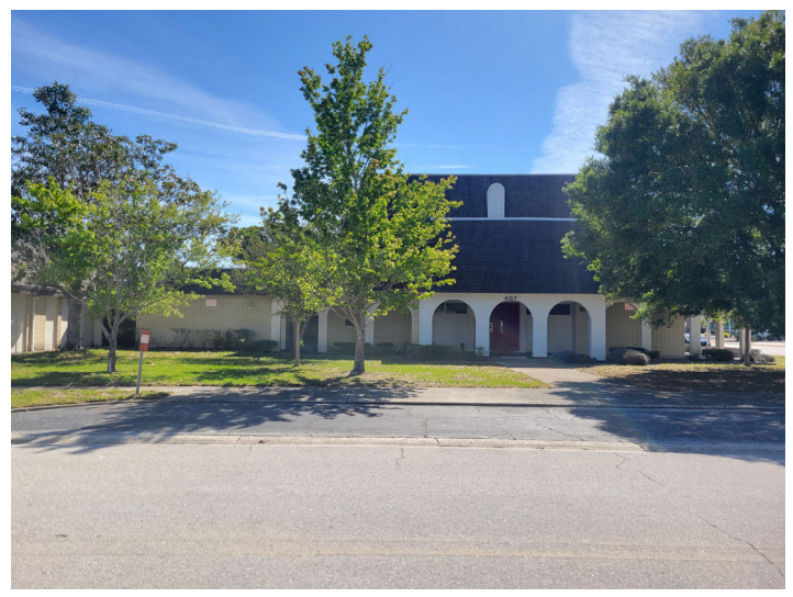
View looking east at the subject property, 407 S Saturn Avenue