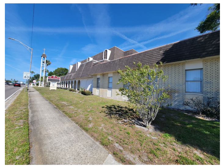
View looking northwest at the subject property from Gulf to Bay Boulevard