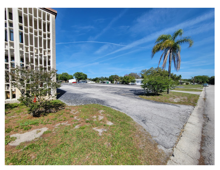
View looking northwest at the subject property