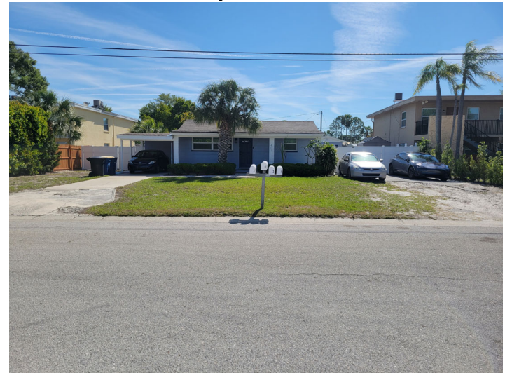
Across S Mars Avenue to the east