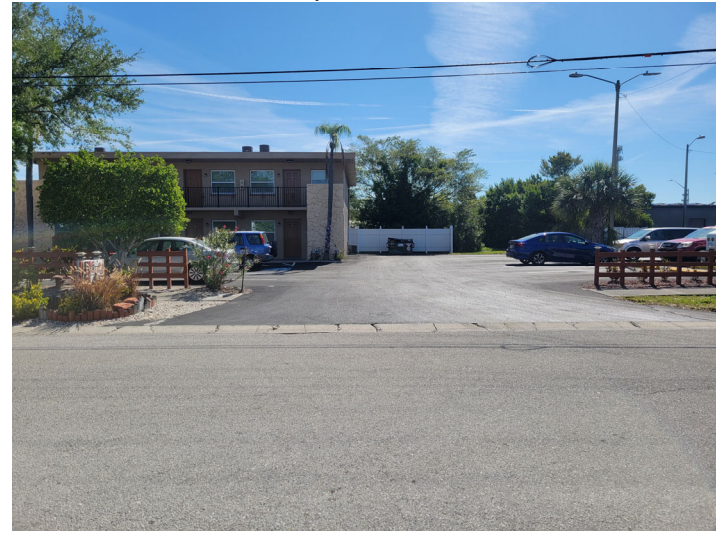
Across S Mars Avenue to the east