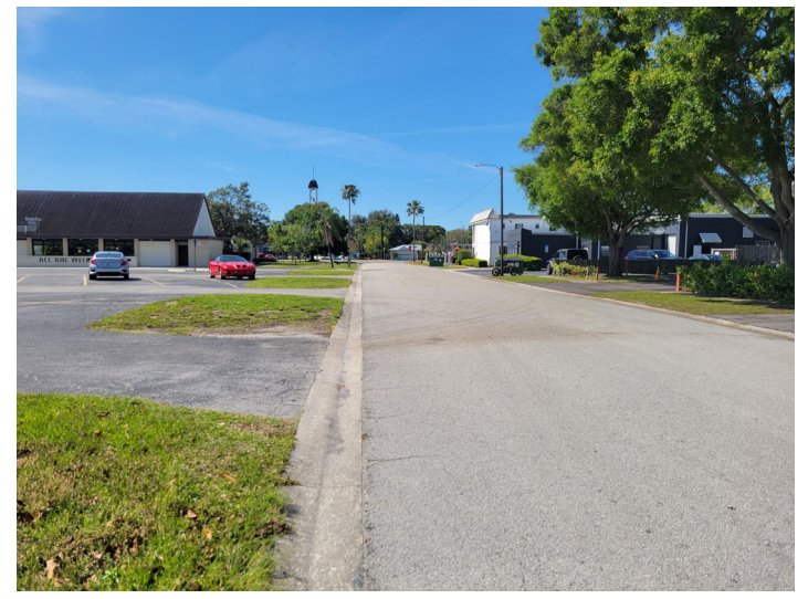
View looking southerly along S Saturn Avenue