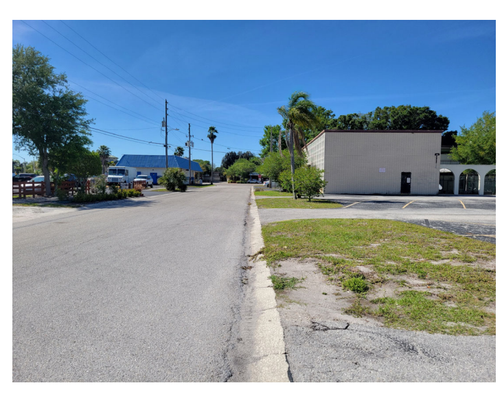
View looking southerly along S Mars Avenue