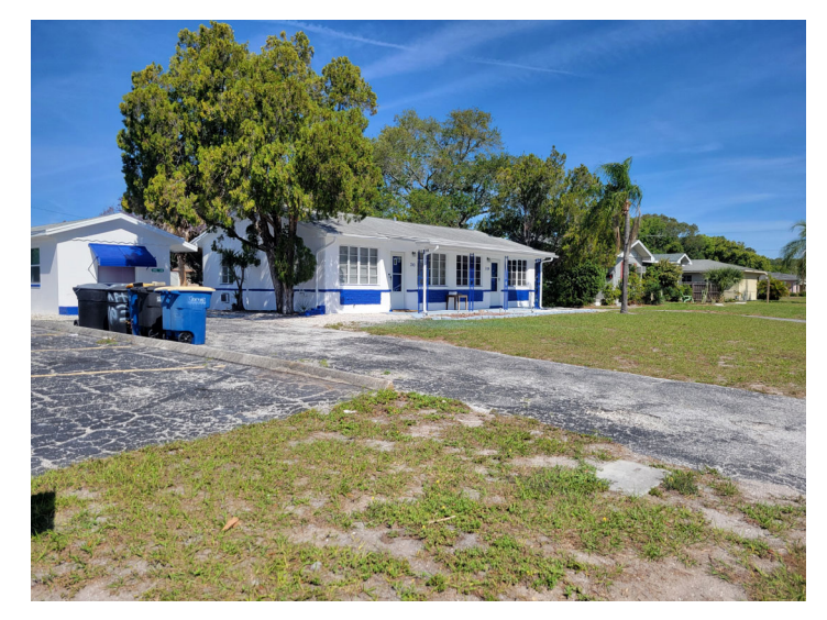
Adjacent to the north of the subject property from S Mars Avenue

LUP2024-02001/REZ2024-02001 St. Paul's Lutheran Church, Inc. 407 S Saturn Avenue