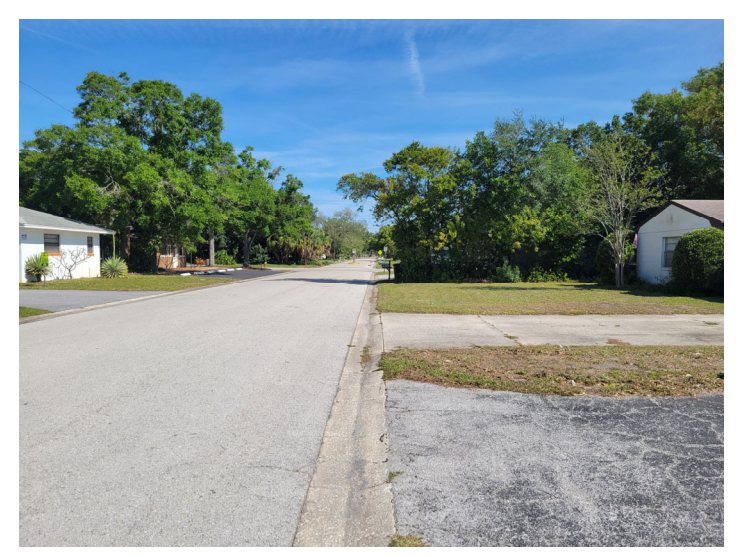
View looking northerly along S Saturn Avenue