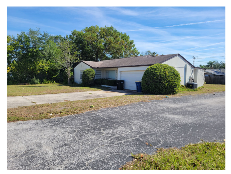
Adjacent to the north of the subject property from S Saturn Avenue