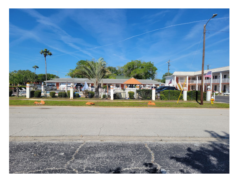
Across S Saturn Avenue to the west